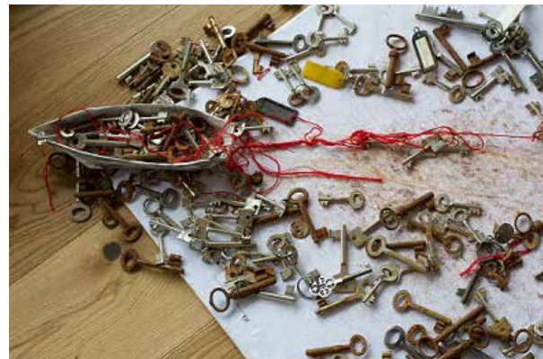
The Key in the Hand 2014