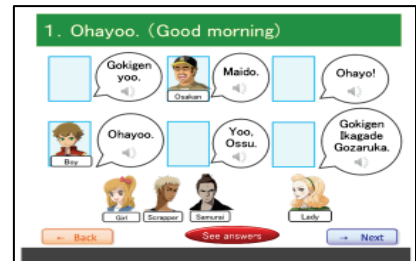
【The Anime/Manga Japanese Course】