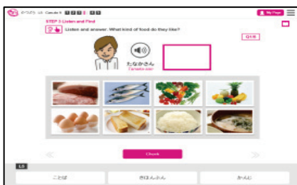
【The Marugoto Course】