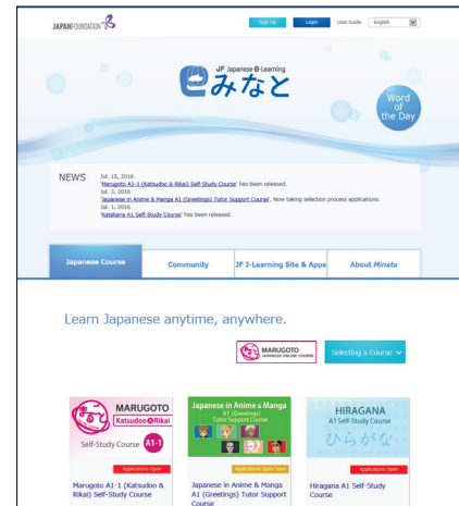
The ‘Minato’ website

Minato allows anyone in online environment to study the Japanese language any time using a computer, tablet, or smartphone. In order to make the Japanese learning more accessible, the Institute has provided a range of courses that allow students to select one that will suit their personal interests. The courses offered are the ‘Marugoto’ course, an integrated teaching of the Japanese language and culture; the Hiragana/Katakana course, focusing on the written characters; and the Anime/Manga Japanese Language Course, a pleasant treat for the eyes at the same time as acquiring the language. While they are mainly ‘self-study courses’ that allow students to learn at their own pace, there are also the ‘tutor-support courses’ that provide assistance of assignments, evaluations, and live lessons with teachers. Further, to solve the concern of online learning being a lonesome pursuit, the online ‘Community’ lets users to communicate and interact with their fellow Japanese language students worldwide. This will stimulate the learning incentive through this virtual cultural exchange with like-minded people across the globe.