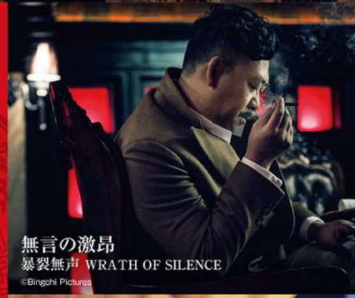
無言の激昂 暴裂無声 WRATH OF SILENCE