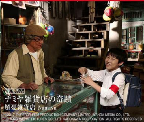
ナミヤ雑貨店の奇蹟 解憂雜貨店 Namiya

©2017 LE VISION PICTURES (BEIJING) CO LTD. ACME IMAGE (BEIJING) FILM CULTURAL CO LTD. FILM CAN PRODUCTION LTD. LE VISION PICTURES (HK) CO LTD