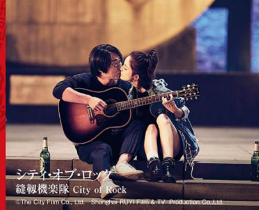
シティ・オブ・ロック 縫製機楽隊 City of Rock