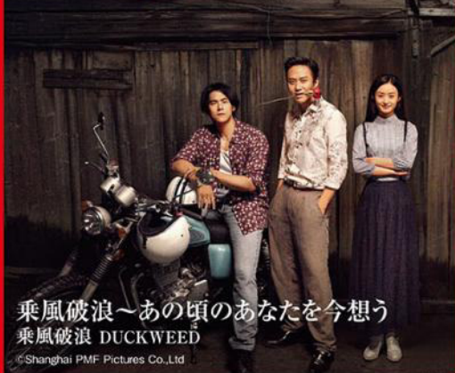
乗風破浪~あの頃のあなたを今想う 乗風破浪 DUCKWEED