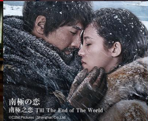
南極の恋 南極之恋 Till The End of The World