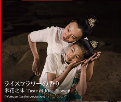
ライスフラワーの香り 米花之味 Taste of Rice Flower