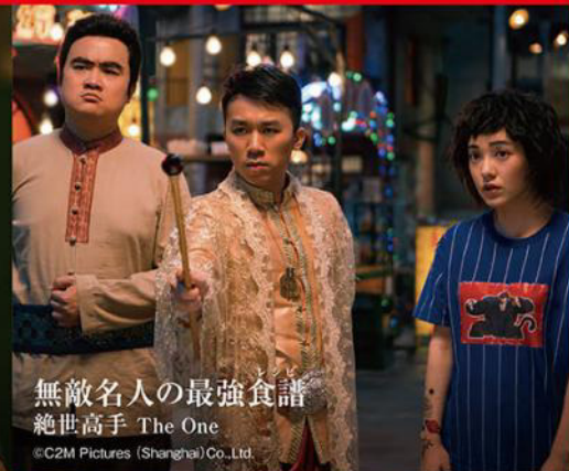
無敵名人の最強食譜 絶世高手 The One