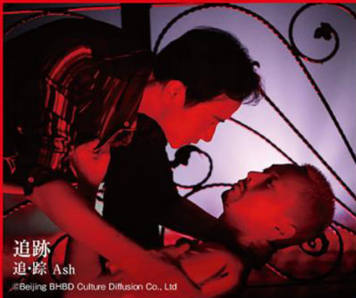
追跡 追・踪 Ash