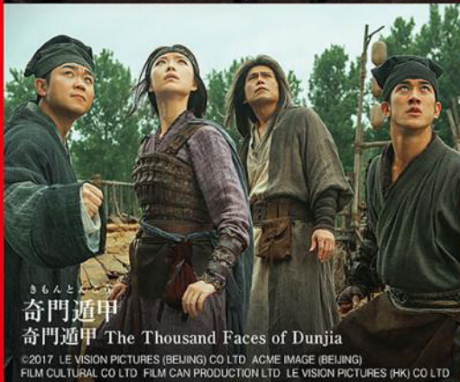
奇門遁甲 奇門遁甲 The Thousand Faces of Dunjia