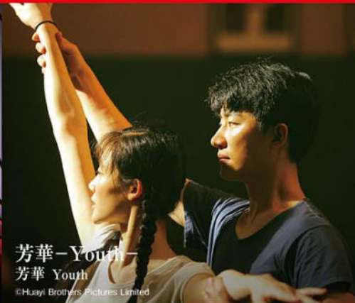
芳华-Youth 芳华 Youth