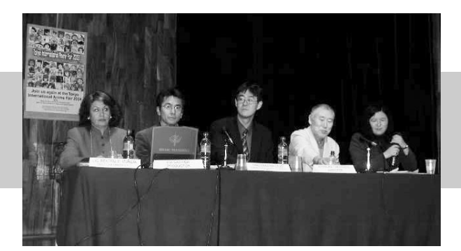
Japanese animation film lectures

The Foundation carries out projects to introduce Japanese culture, and also accepts project proposals by local artists and persons who are engaged Japanese and Brazilian cultural exchange. The Foundation is also recognized as the base for transmission of Japanese culture by cultural institutes in Brazil as well, and interest in the Foundation's projects, requests for information on Japanese culture in general and advice given to the Foundations project policy have been increasing.