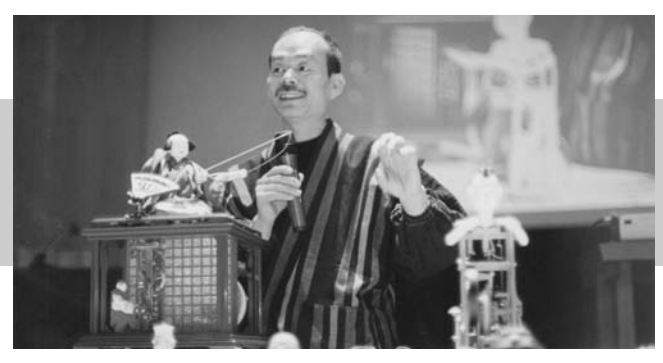
Karakuri Ningyo: Mechanical Dolls: Lecture and Demonstration