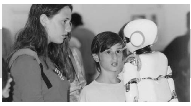
Japanese Robots: Lecture and Demonstration PINO

The "Beauties of Japan: Heart of Japan" exhibition was held to introduce an overview of Japanese arts from the 14th to 19th centuries at the Art and Exhibition Hall of the Federal Republic of Germany in Bonn (August to October, exhibition of the collection of the Tokyo National Museum), which attracted about 97,000 visitors and was accepted favorably (the Japan Foundation provided a subsidy to the Noh performance as part of the event and co-hosted the Japanese architecture lecture). The "Yayoi