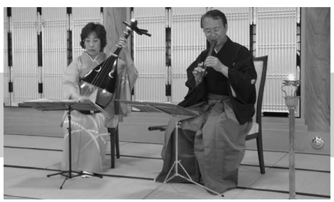
Satsuma Biwa and Shakuhachi Concert

The Institute focused on conducting cultural events targeting the younger generation, development of joint projects between Japan and Germany, reinforcement of the network among regions and support for Japanese-Language education in the German speaking areas with the objective of further deepening mutual understanding as well as raising the interest in Japan, utilizing the Japan-Germany exchange momentum generated through the "Year of Japan in Germany" in 1999 and the Japan-Korea joint hosting of the World Soccer Cup in 2002.