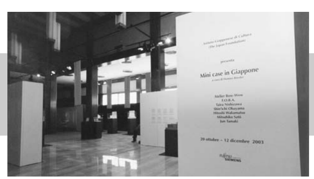
"Mini casa in Giappone: Small house in Japan" exhibition

In answer to the high number of requests for an event on Japanese food, which is booming in Italy, the Institute held an event entitled "To taste with all five senses" introducing the world of Japanese confectionery that surprisingly was unknown to the Italians. When the Institute held this event (a lecture and demonstration) three times for the general public and once for the students at the cook