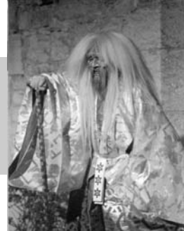
Twelve Scenes of the Inner Moat or Double Shadow

The event was extremely popular and admission tickets sold out immediately after the start of sales, and the audience was extremely enthusiastic. The main reason for this success must be the performances by the first-class artists, but it also indicates that the performing art of Noh is highly recognized in France. This