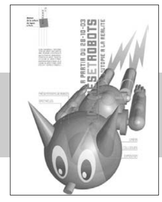
A poster of the Humans and Robots Exhibition

There were several major exhibitions of Japanese visual art. In