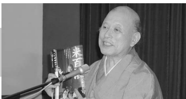
100 Sacks of Rice