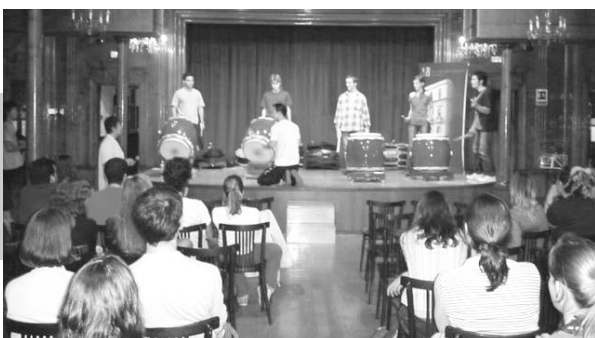
Japanese drum workshop

The Japan Foundation dispatches renowned Japanese specialists to developing countries upon request for cooperation in education in various cultural fields, to provide advice and instruction to the local leaders and specialists and to conduct research on the local conditions.