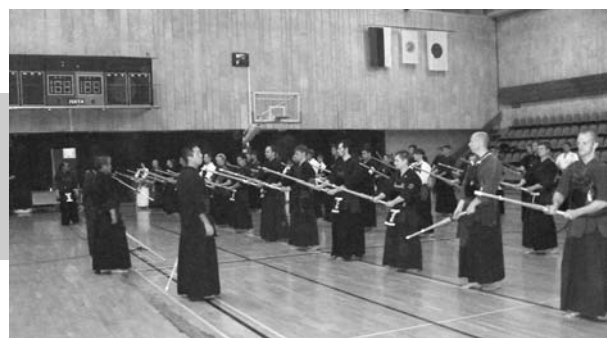
Kendo and ancient martial arts demonstration