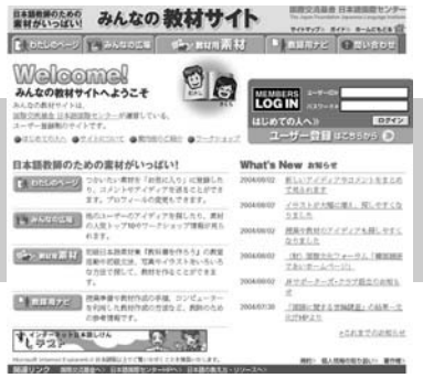
Minna no Kyozai

A Fellow developed the Reference Book for Comprehensive Curriculum for Elementary Level Japanese-Language (with CD-ROM) for the Comprehensive Curriculum for Elementary Level Japanese-Language (with CD-ROM) for multimedia-type teaching materials that the Fellow developed for teachers and students who