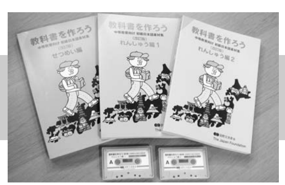
Kyokasho o Tsukuro

This newsletter carries useful information for Japanese-Language teachers overseas. The Institute published 17,000 copies each of issues No. 46 to No. 48. The entire text from each issue starting with No. 28 appears on the website (http://www.jpf.go.jp/j/urawa/).