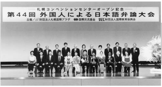
44th Foreigners' Japanese Language Speech Contest

Course period: September 26, 2003 to September 25, 2006 Trainees: 1 person from 1 country