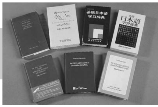
A Basic Japanese Language Learning Dictionary