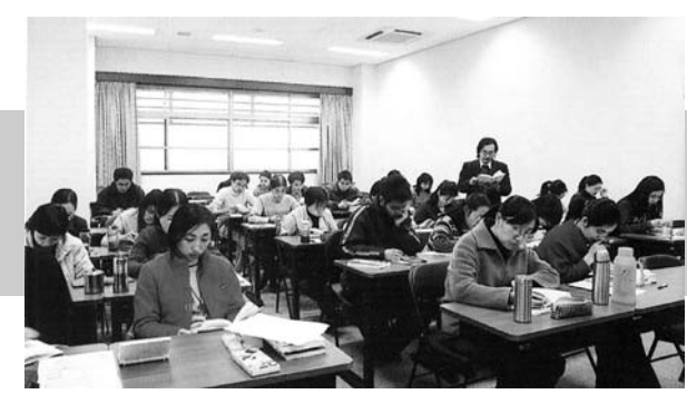
Beijing Center for Japanese Studies