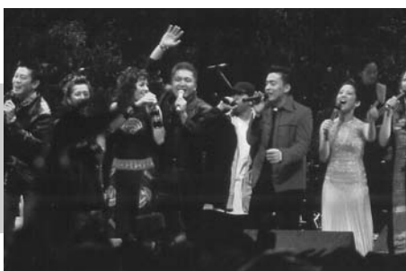
J-ASEAN Pops concert in Yokohama