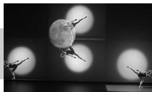
Iris by Mr. Philippe Decoufle