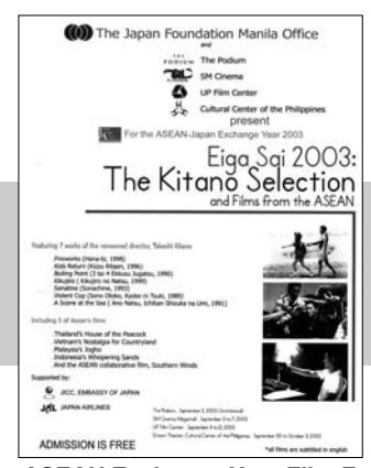
Japan-ASEAN Exchange Year Film Festival, Manila, Philippines

Films released by the Art Theatre Guild were screened at the Vienna International Film Festival and later in several venues in Germany including the Japan Cultural Institute in Cologne.