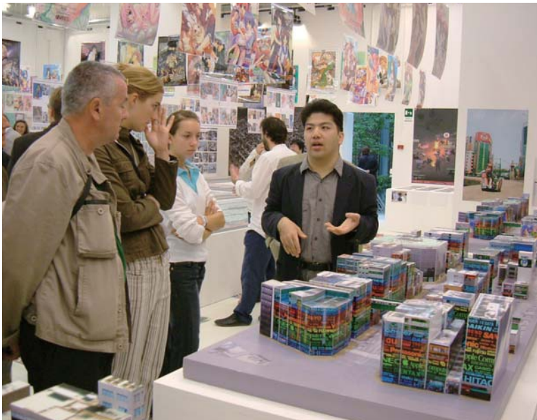
Commissioner Morikawa and visitors beside Akihabara models

This unorthodox show—different from traditional architectural displays at Venice Biennale—showed the universal relevance of contemporary Japanese culture. The exhibit was enthusiastically received by a large international audience at Venice, as well as many visitors in Japan.