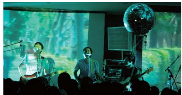
Concert in Bangkok

From September 10 to 15, the SOI Music Festival was held to showcase Japanese and Thai “indie” music. The event, which took place in Bangkok, was cosponsored by the Japan Foundation there and local supporters. In October, the event was repeated in Tokyo with assistance from Japan Foundation headquarters.