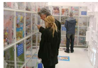
Visitors mesmerized by Otaku possessions