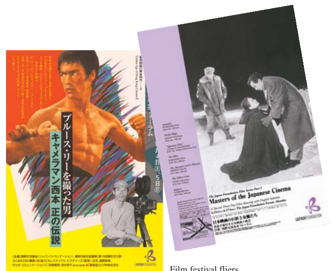
Film festival fliers