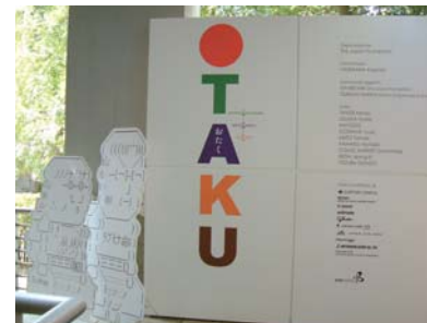
Japanese Pavilion entrance