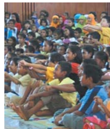
Children delighted at the sight of Kazenoko on stage

they were greeted by the rapturous faces of children utterly absorbed in the fun. But the tour was not only designed to bring spiritual solace through theatrical performances; it also sought to ensure that children would continue to enjoy such opportunities to refine their aesthetic awareness. To that end, workshops were held for local educators on ways in which banana leaves, newspapers, and other everyday objects could be put to creative use in the classroom.