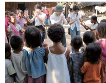
Kazenoko members on a visit to a camp