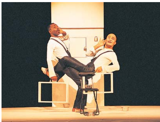
Al-Murwass Group on stage

In addition, a group of 10 social studies teachers and four educational administrators from Iraq's Samawa region also came to Japan, where they paid visits to the Ministry of Foreign Affairs, the Ministry of Education, and the Saitama Prefectural Board of Education. In addition, they met with students and teachers at primary and junior high schools in the prefecture.