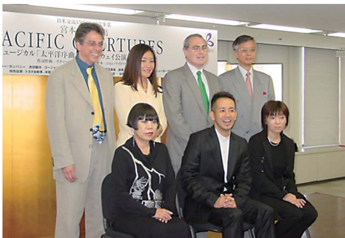
Announcing the production at Japan Foundation headquarters (July 2004)

The show created quite a sensation, attracting an audience of 70,000 spectators during its December 2 to January 31 run.