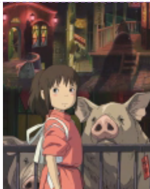
▲ Spirited Away ©2001 Nibariki, GNDDTM.