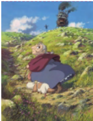
▲ Howl's Moving Castle