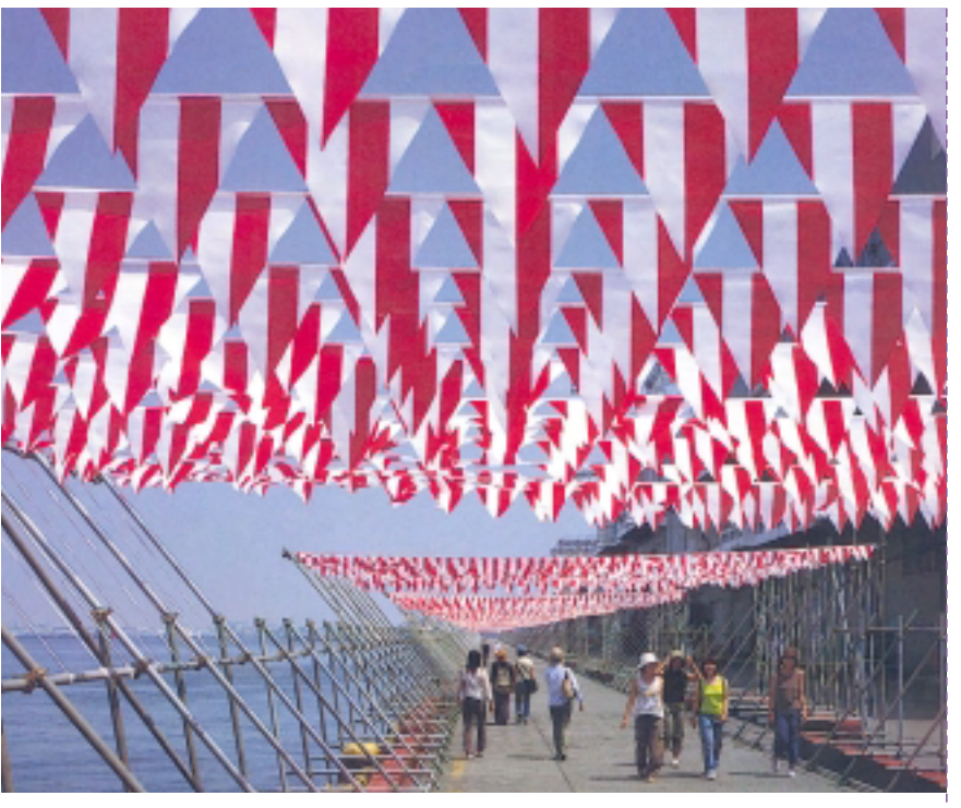
▲ Daniel Buren, "On the Waterfront: 16150 Flames", work in situ for Yokohama Triennale 2005.