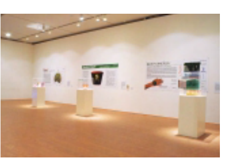
▲ Exhibition at the Museum of Contemporary Art Tokyo

New European reality after the demise of the socialist order