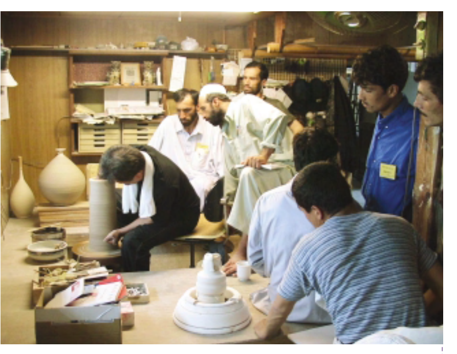
Potters from Istalit (north of Kabul) visiting a pottery in Tobe, Aichi.