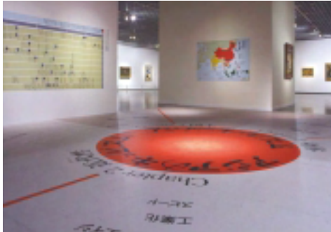
▲ Tokyo exhibition (The National Museum of Modern Art, Tokyo).