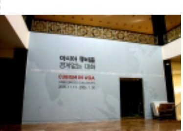
▲ Seoul exhibition (The National Museum of Contemporary Art, Korea).

In addition to the exhibition, international symposiums were held in the three cities.