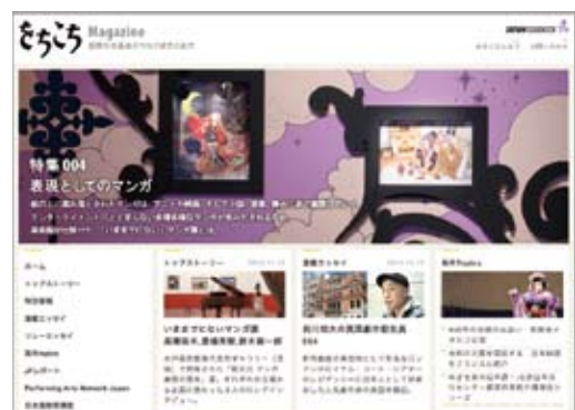
Wochi Kochi Magazine on the Web