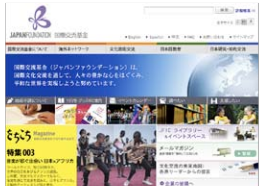
Official website of the Japan Foundation

Contact: Phone: 81-3-5369-6086 Email: Lib@jpf.go.jp