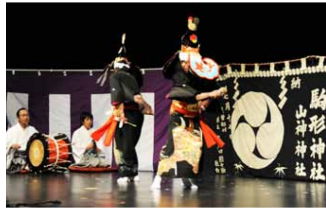
Introducing the Charm of Tohoku through Folkloric Performing Arts

Tohoku is a region rich with folkloric performing arts. Concerts were performed in eight cities in the United States, France, and China, with folk performance groups—Wakumizu Kagura of Tono City, Kuromori Kagura of Miyako City, and Usuzawa Shishiodori of Otsuchi Town of Iwate Prefecture—and music by Ondekoza & Musicians with Wadaiko drum players and musicians transcending genres. Above: Usuzawa Shishiodori in Guangzhou in China; bottom left: Kuromori Kagura at the Lycée International de Saint-Germain-en-Laye in Paris; and bottom right: Wakumizu Kagura in Los Angeles.