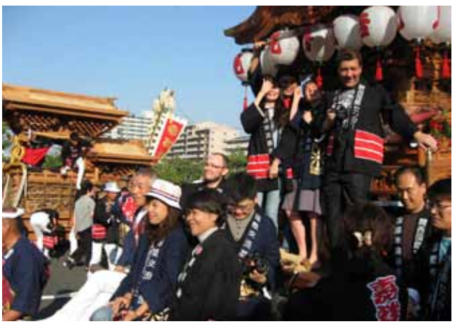
Experiencing Japanese Culture through Citywide Exchange Participants of a program at the Japanese-Language Institute, Kansai at a local autumn festival. Various programs have been carried out for better understanding of Japanese culture and society.