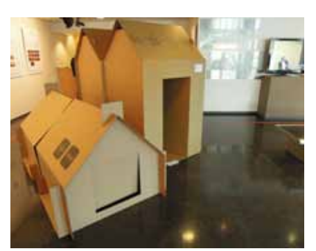
Architectural Approaches for Disaster Recovery

Architects were among the first to go to the region and examine the devastation. An exhibition showcasing their approaches for recovery was held in Paris.