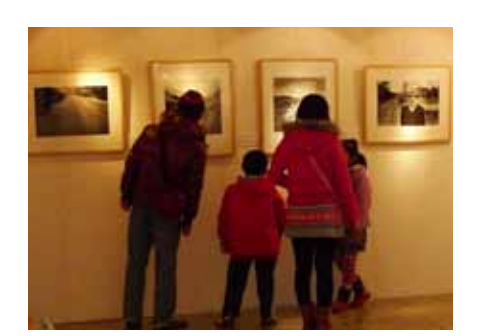
TOHOKU Photo Exhibition Held in Beijing The exhibition consisting of 10 photographers' works highlighted different aspects of village life, rituals and festivals, and nature. The event attracted more than 2,000 visitors