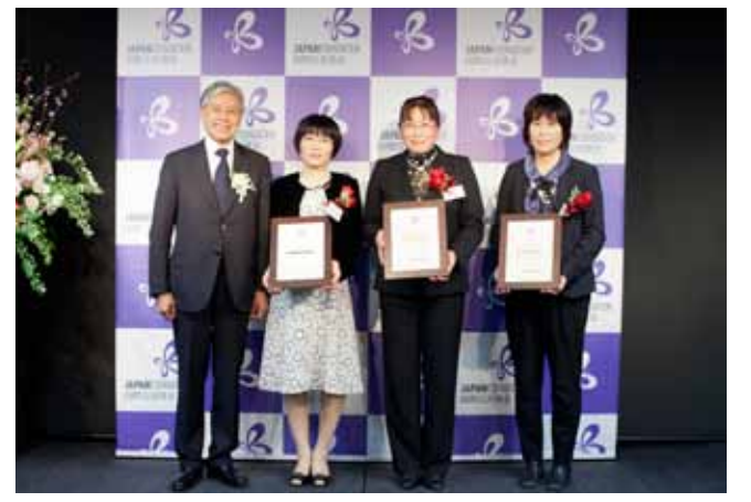
President's Special Prizes to Three Groups

The Japan Foundation Prizes for Global Citizenship President's Special Prizes were awarded for their recovery efforts through international cultural exchange to Rikuzentakata City International Exchange Association, Tomodachi in Natori International Relations Association, and The People (Fukushima Pref.).