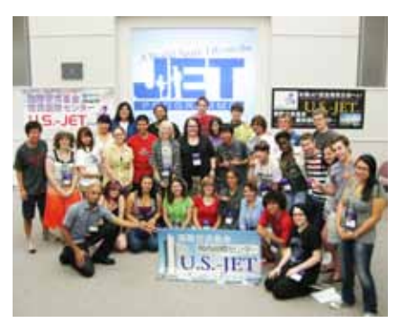
Bridging Japan and the United States American high school students visited the region to honor the two American JET teachers who died in the disaster and attend a training program at the Kansai Institute.

Architects were among the first to go to the region and examine the devastation. An exhibition showcasing their approaches for recovery was held in Paris.