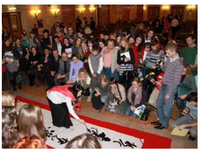
Learning Japanese through the Culture A scene from Japanese-language courses provided in Russia, Ukraine, and Kazakhstan. Participants furthered their understanding of the Japanese language and culture by appreciating the beauty of Japanese characters demonstrated by a calligrapher.