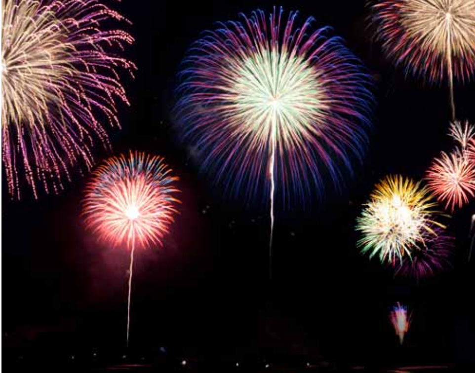
Memorial Fireworks for the Earthquake Victims

In August 2011, the LIGHT UP NIPPON project launched fireworks in 10 locations devastated by the tsunami to remember the victims and express hope for recovery. The Japan Foundation produced a documentary film of the event to introduce how the young people are engaged in recovery activities. This film was broadcasted and screened worldwide.