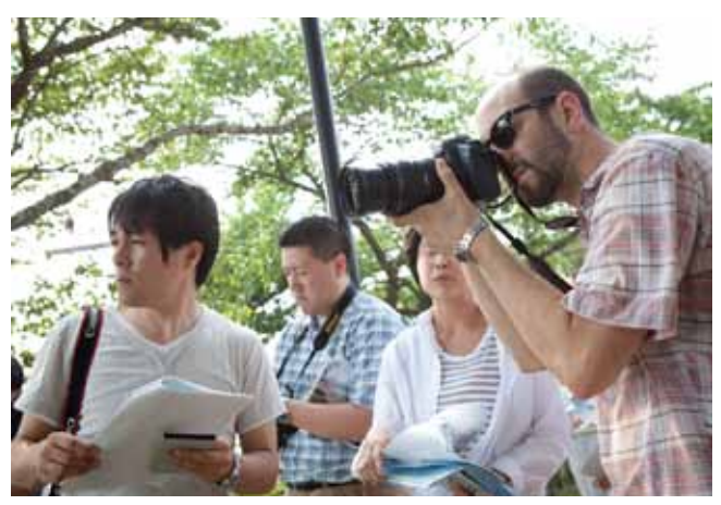
"Genki Mail" from Children in the United States

The Japan Foundation Prizes for Global Citizenship President's Special Prizes were awarded for their recovery efforts through international cultural exchange to Rikuzentakata City International Exchange Association, Tomodachi in Natori International Relations Association, and The People (Fukushima Pref.).