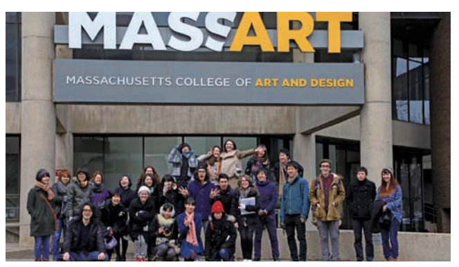
Student Creators Exchange at the Massachusetts College of Art and Design.

Students' comments included, "As we talked with each other on a personal level, I felt that we were building kakehashi bridges between our two countries" and "As we Japanese become more active abroad, I realized how important it is to explain the best things about Japan."