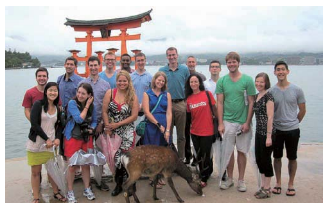
Students visiting Miyajima, Hiroshima Prefecture.

On their last day in Japan, they held a wrap-up session. This most meaningful program enabled the students to use their expertise and gain first-hand experience to deepen their understanding of Japan.