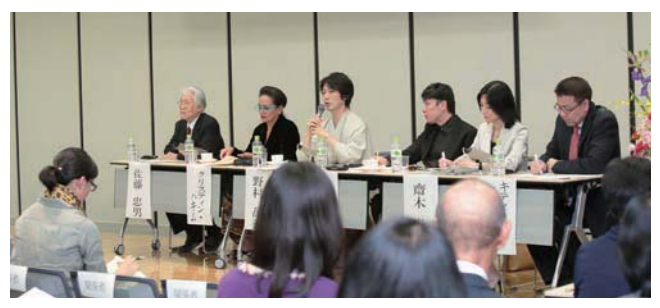
Symposium "Asia in Harmony: New Horizons for Cultural Exchange"