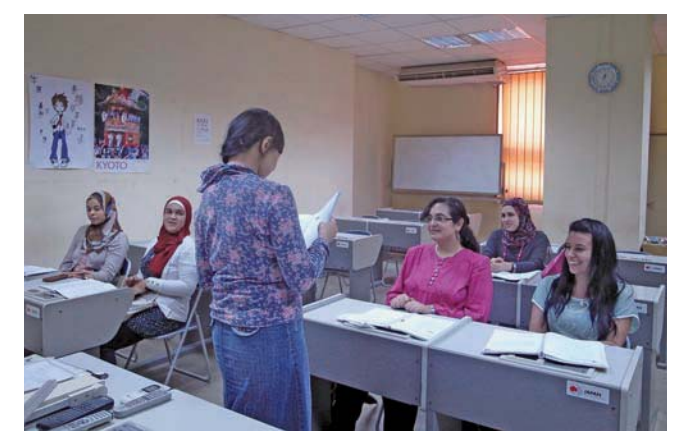
Japanese-language class at Ain Shams University

The Japan Foundation gave financial support to the department to employ a Japanese instructor. The instructor provides thesis and research guidance to undergraduate and graduate students and gives lectures about Japanese culture and society. This results in higher quality Japaneselanguage education.