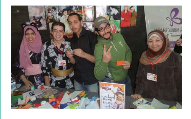
Major Event by Anime Fans in Egypt

After the change in government in July 2013, the Japan Foundation, Cairo held various events with our local partners even in the unstable political environment.