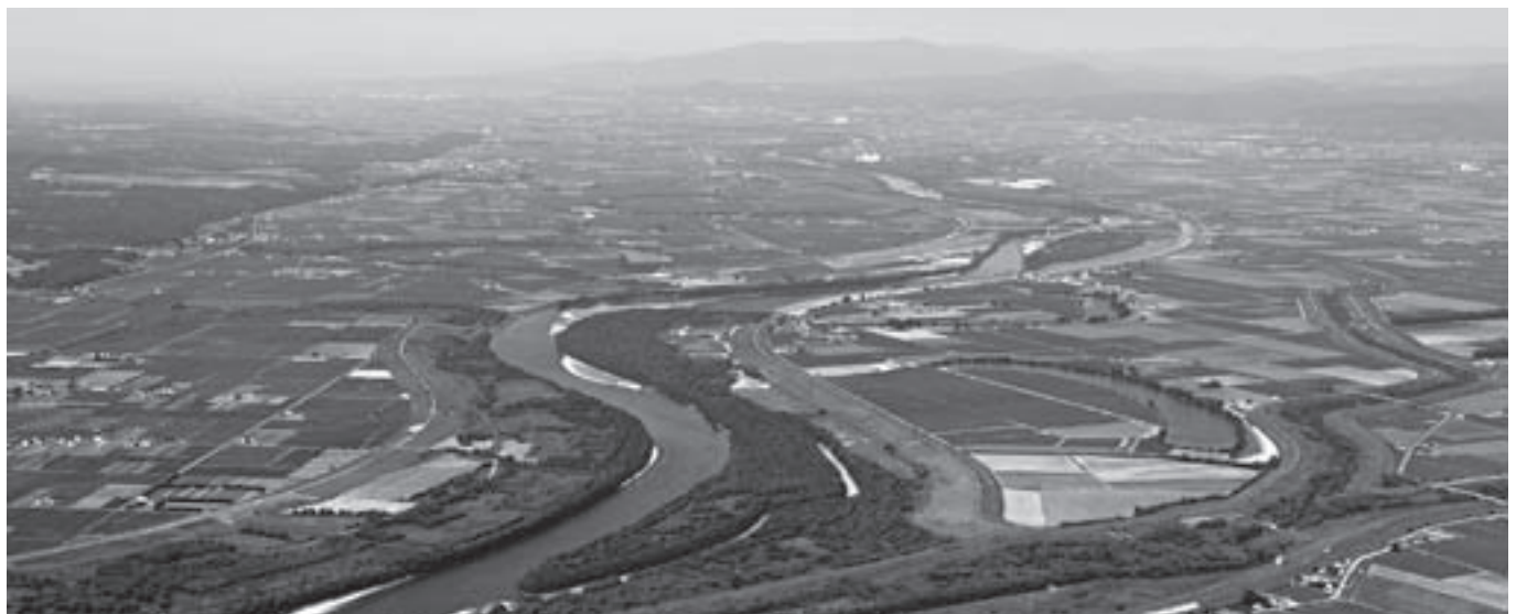
A view of the Ishikari River in Hokkaidō.

Ishikarigawa was published serially in seven magazine installments, the first installment appearing in September