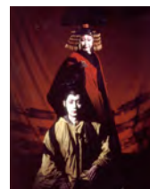
A theatrical production "Lear" with staff and cast from six Asian countries (1997)