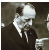
Andre Malraux, former Minister of Culture in France invited under the Japan Foundation Fellowship Extraordinary program (1974)

1993 Published the first issue of Japanese Book News