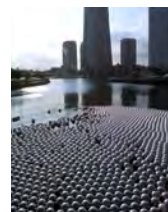
Kusama Yayoi's Narcissus Sea , 2001 (Yokohama Triennale 2001)