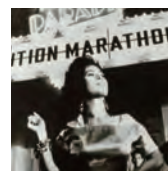
The Southeast Asia Festival '92 in celebration of the 25th anniversary of the establishment of ASEAN (1992)

2010 Released "JF Standard for Japanese-Language Education 2010"