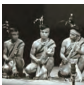
The first Asian Traditional Performing Arts (ATPA) exchange program (1976)