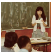
Training Programs for overseas teachers of the Japanese Language (1981)

1994 Held performances of a triple production of Noh, Bunraku, and Kabuki versions of "Shunkan" in Europe