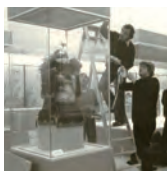
"The Great Japan Exhibition: Art of the Edo Period" as the main event of "Japan in London" (1981)