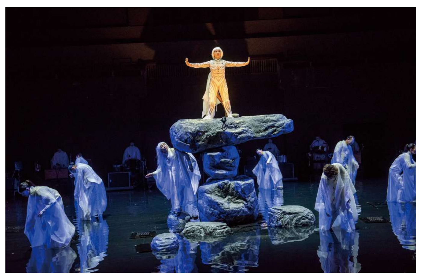
A performance of "Antigone" in New York as an official "Japan 2019" project.

From traditional performing arts to contemporary theater, the Japan Foundation has shared its excitement with overseas audiences through the introduction of Japan's unique performing arts. It was the tireless efforts and enthusiasm of all involved that led to the realization of these historic performances.