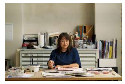
Ms. Shiota is an artist born in Osaka and living in Berlin. "I believe that art is something that can be shared beyond language and national borders, and that it can create a dialogue where nationality and gender are irrelevant," she says. Shiota Chiharu – Berlin, 2020