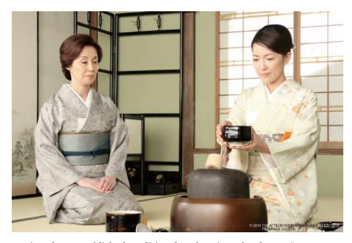
Set in a long-established traditional ryokan inn, the drama "Hanayome Noren (Bride and Pride)" depicts the battle between a former career woman and her traditionally minded mother-in-law. In Japan, 205 episodes across four seasons were broadcast between 2010 and 2015.