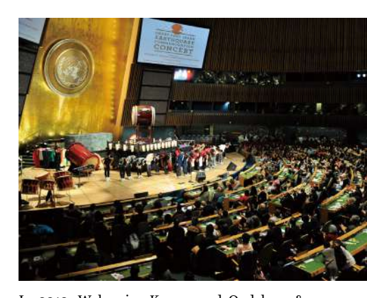
In 2012, Wakumizu Kagura and Ondekoza & Musicians gave a moving performance at the United Nations General Assembly Hall. Filling the huge venue with exhilaration, this concert was a great success, with standing ovations continuing long after the performance ended.

In March 2012, JF organized a month-long comprehensive cultural program, "Overcoming the Disaster: Gratitude from Japan to the World," which featured stage performances, exhibitions, lectures, films and documentary screenings and other programs about Tohoku and its recovery and revitalization. These were