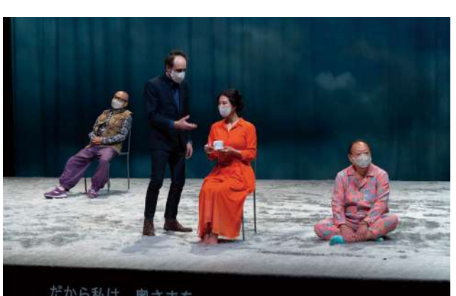
SPAC AUTUMN – SPRING 2021 – 2022 #2 "The Cherry Orchard" selected for the International Creations in Performing Arts Program and performed at the Shizuoka Arts Theatre (2021)

In each of the performances, "Shunkan," "Antigone" and "The Cherry Orchard," a deep relationship of trust was established among the performers and the producers, and this has resulted in performances that will be talked about for years to come. In addition, although they are all classical productions, they all share the same universality of storytelling that transcends country and time. It strongly appeals to our modern-day hearts and minds. The miracle of a once-in-a-lifetime encounter, in which the audience and performers share time and space, is the quintessence of performing arts. JF will continue to promote performing arts performances as a nexus that connects the amazing talents of artists who create excitement.