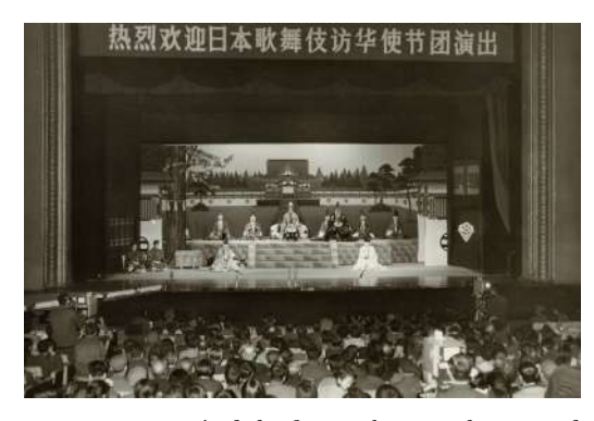
In 1979, JF organized the first performance by a Grand Kabuki troupe in China. The 20-vehicle-long cavalcade of performers, comprising some 70 members of the troupe aboard luxury limousines and minibuses, with an accompanying police escort, received a rousing welcome from the citizens of Beijing.

Regarding the production "Antigone," Mr. Miyagi said, "The venue in Avignon was the courtyard of the Pope's Palace, the pinnacle of power in Europe in times past. It has a glorious history, but it also cohabits with the souls of countless people who experienced tragic deaths and remained unnoticed. Mourning these unfortunate souls with care is an important theme of 'Antigone.' We hoped to bring peace to the innumerable souls present in the Pope's Palace. On the other hand, I thought it was a strange coincidence when I learned that the Park Avenue Armory was also a former military facility for an infantry regiment that fought in the American Civil War. This was also a place where the dead were