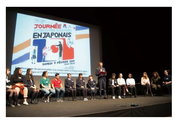
During the "Interschool Presentation Day," the younger generation took on a leading role. High school students from Japan and France gave presentations at the Japan Cultural Institute in Paris under the theme, "Discovering Japan-France Exchange through People, Their Lives, and Their Works: The Role of the Individual in History leading to Japonismes 2018."

Cultural and artistic exchanges is one area that appeals directly to people's hearts, creates a sense of empathy that transcends language, and fosters a broad range of fans of Japan by facilitating new discoveries and the joy of shared creation. Japanese festivals, demonstrating such essence, are the perfect opportunity to showcase not only the ageless charm of Japan, but also its new "face" - which is constantly being updated. JF will continue to bring about these high-quality projects around the world with the cooperation of many people so that visitors can experience the multifaceted aspects of Japanese culture.