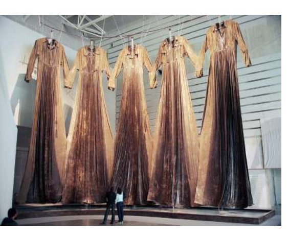
The first Yokohama Triennale attracted approximately 350,000 visitors during its two-month duration. The photo shows the exhibits mentioned by Ms. Shiota. Chiharu Shiota, Memory of Skin, 2001. Installation: dresses, dirt, water, showers. Yokohama 2001 - International Triennale of Contemporary Art: Mega Wave - Towards a New Synthesis, Yokohama, Japan. Photo by ITO Tetsuo @JASPAR, Tokyo, 2022 and Chiharu Shiota.