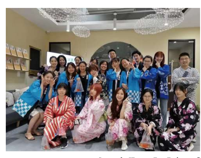
Centers for "Face-to-Face Exchanges," located in 18 cities across China, provide Chinese youth with the latest information about Japan and promote exchange between Japanese and Chinese youth. This photo shows an event held at the Chengdu Center for "Face-to-Face Exchanges" in 2020.