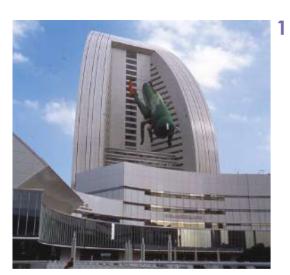
Tsubaki Noboru + Muroi Hisashi The Insect World / Locust 2001