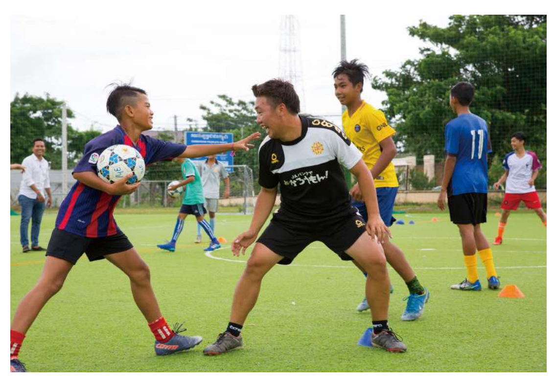
The photo is from when coaches of Giravanz Kitakyushu were dispatched to Cambodia for a short period of time.

The Japan Foundation has been engaged in sports exchange projects since its establishment. Here, we would like to introduce several unique projects that JF has implemented involving judo and football in Asia in recent years.