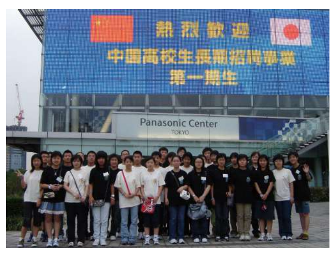
The first group of Chinese high school students came to Japan in 2006. By 2019, a total of 442 high school students had visited Japan across 14 groups.