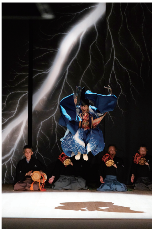
"SAMBASO, divine dance" performed by Mansai Nomura

We create the foundations for promoting cultural and artistic exchange by building on exchanges and collaborations among specialists from various countries and regions. We aim to build a network that underpins exchange and support individuals behind those exchanges by creating dialogue and joint venture activities which transcend national boundaries. This involves inviting and dispatching experts in various fields, such as museum curators, theater and festival directors, publishing editors and translators, or film directors. We also collect information on Japanese culture and the arts, and share them online.