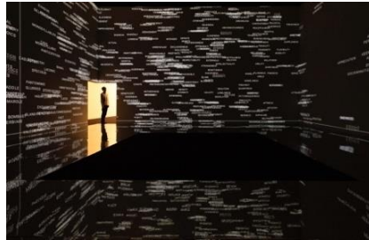
Dumb Type, TRACE/REACT II , 2020, Video Installation, 10m x 10m x H6m, Installation view from the exhibition 'Dumb Type | Actions + Reflections' at Museum of Contemporary Art Tokyo, 2019-20, ©Dumb Type, photo: Kazuo Fukunaga, photo courtesy of the artist