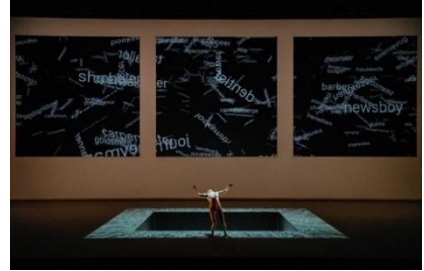
Dumb Type, 2020 , 2020, Performance at ROHM Theatre Kyoto, ©Dumb Type, photo: Kazuo Fukunaga, photo courtesy of the artist