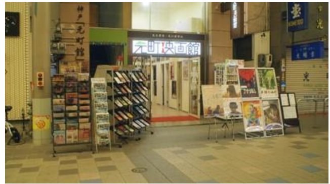
Motomachi Movie Theater (Kobe, Hyogo)