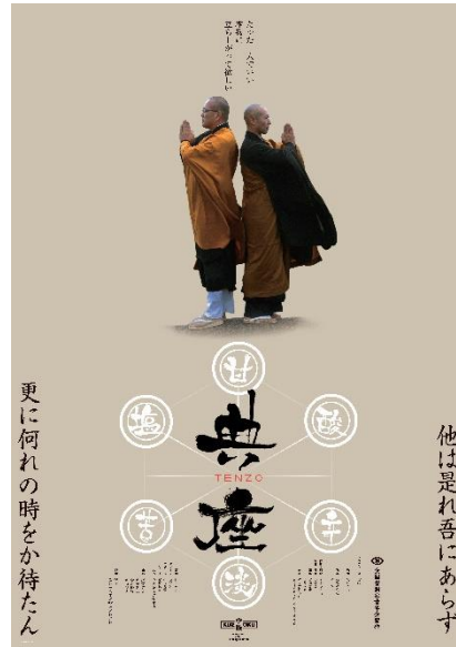
©Kuzoku Inc. [Selected by jig theater] TENZO (2019) Directed by TOMITA Katsuya