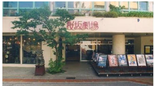
Sakurazaka Theater (Naha, Okinawa)