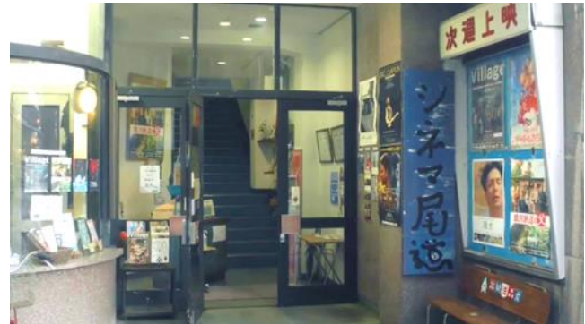
Cinema Onomichi (Onomichi, Hiroshima)