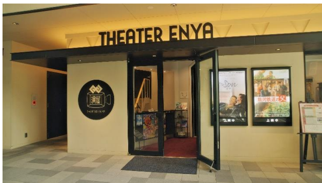
THEATER ENYA (Karatsu, Saga)