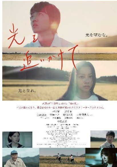
[Selected by Cinema de Aeru] Follow the Light (2021) Directed by NARITA Yoichi