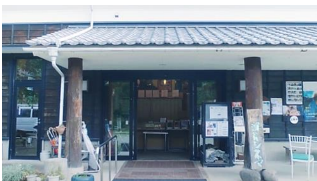
fukaya cinema (Fukaya, Saitama)