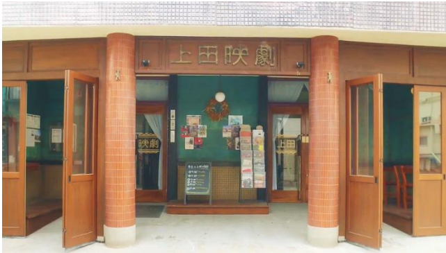
Ueda Eigeki (Ueda, Nagano)