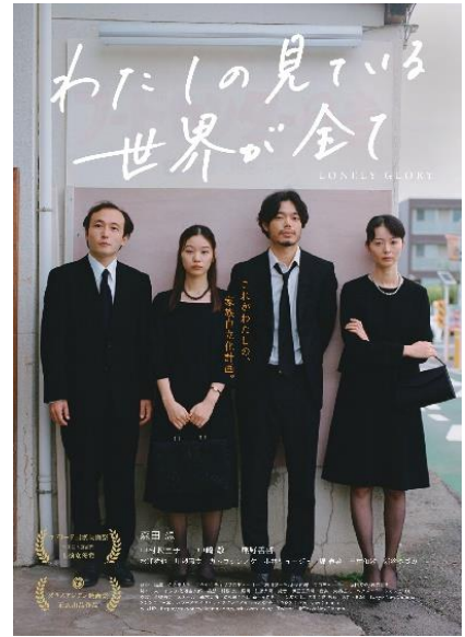
©2022 Tokyo New Cinema [Selected by Cinekoya] LONELY GLORY (2022) Directed by SAKON Keitaro