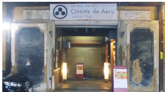
Cinema de Aeru (Miyako, Iwate)