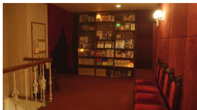
Cinekoya (Fujisawa, Kanagawa)