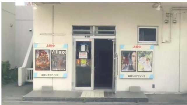
CINEMA IRIS (Hakodate, Hokkaido)