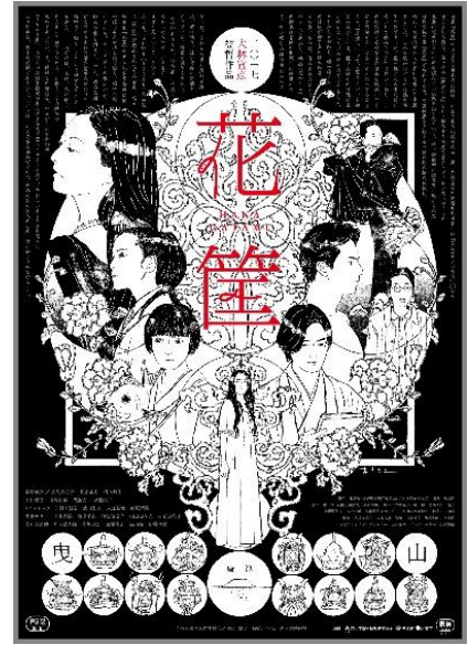
[Selected by THEATER ENYA] HANAGATAMI (2017) Directed by OBAYASHI Nobuhiko