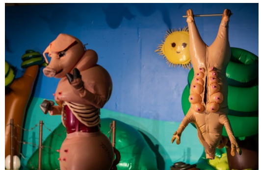
“Slaughterhouse” (2019)