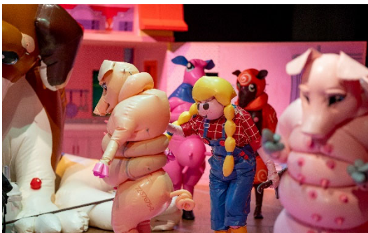
“Cycle of L” (2020) is a production by Saeborg and The Museum of Art, Kochi, produced based on the previous production “House of L” (2019)

Through this project, we aim to deepen understanding in Brazil of the diversity, uniqueness, and universality of contemporary Japanese artistic expression, and to further promote cultural and artistic exchange between our two countries in the years to come.