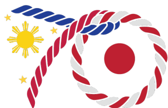
Years of Philippines - Japan Friendship 日本・フィリピン友好年 1956 - 2026

We hope that the three concerts in Manila and Cebu will familiarize audiences with the cultural ties between the two countries through jazz.