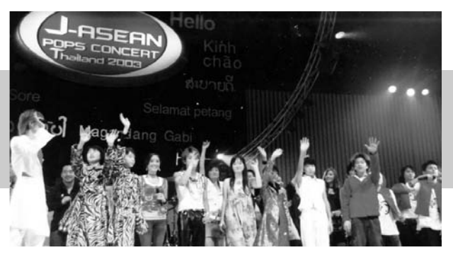
J-ASEAN Pops Bangkok performance