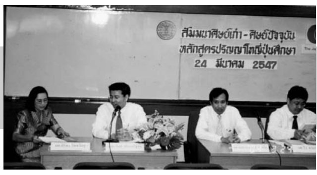
Joint seminar at Thammasat and Chulalongkorn University