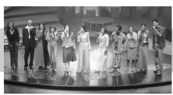
J-ASEAN Pops Concert in Kuala Lumpur

At the working group meetings held at the same time, teachers at secondary schools, higher educational institutes, preparatory education and civilian educational institutes gave presentations on the status of textbook preparation and the usage in Malaysia. Information exchange in this field had not been active, and the seminar offered a good opportunity for the participating teachers to exchange practical ideas.