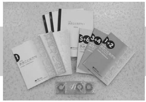
Japanese-Language textbook Akiko to Tomodachi

Cultural exchange with Japan at the local community level is not as active in Indonesia as it is in Europe or the U.S.A., but it is gradually increasing. This could be said for most states and cities that have sister cities in Japan.