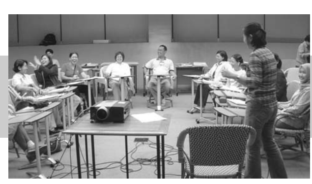
A scene from the emersion weekend for Japanese-Language teachers