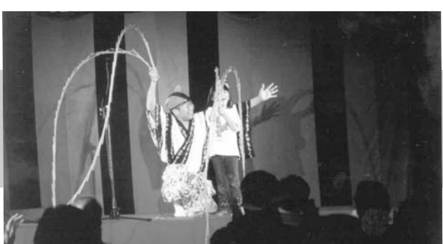
Rakugo in English