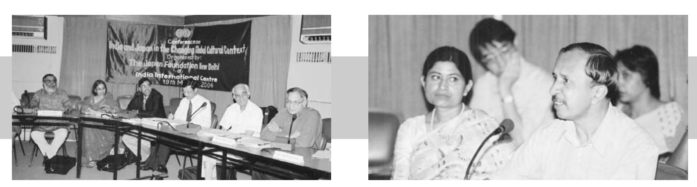
Japan Foundation Fellow Conference

This conference, lasting the entire day, was also a reunion of the fellows of the Foundation. It is expected to be held every few years and take root as a forum to provide recommendations to the Foundation.