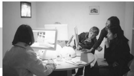
Humans and Robots: From Dreams to Reality © <Fantasies cybernéochitiques> Maison de la culture du Japon à Ioch Paris