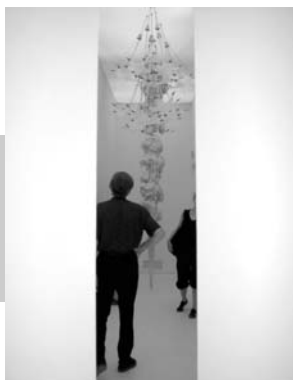
50 th Venice Biennale

This was a compound project probing the reasons behind the strong interest in the Japanese humanoid-type robots from the cultural aspect. See the paragraphs on the Japan Cultural Institute in Paris (The Japan Foundation) in p.36 for the details.