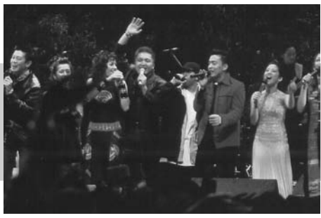
J-ASEAN Pops concert in Yokohama