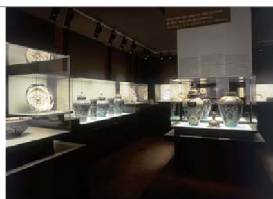
Imari ware exhibition

The Japan Cultural Institute in Paris celebrated its seventh anniversary during the year. In operating its programs, it has always given first priority to thematic unity and careful planning. For example, its fascinating exhibition of Imari ware, which ran from