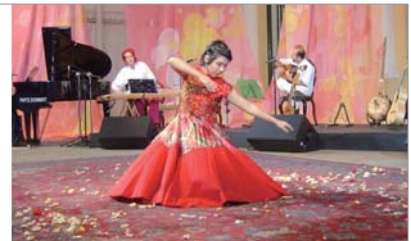
“Zakuro Bonsai,” part of a Japanese concert series

The Japan Foundation, São Paulo built on ties formed through art fellowships in the past to present a program of dance performances, a key area of cultural exchange between Brazil and Japan. This program, which combined film, stage performance, and symposium discussion, received excellent reviews, together with a special program highlighting points of contact between Brazilian and Japanese culture. The Foundation also presented a series of lectures designed to enhance