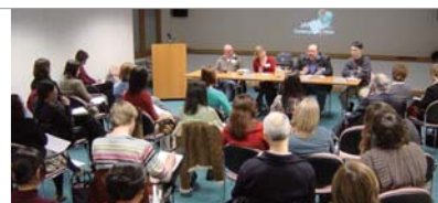
Talk on contemporary Japanese performing arts (February 2005)

To ensure continued enhancement of Japanese studies, the Japan Foundation, London began taking steps to rebuild its network of past fellowship participants. In accord with the British government's decision to strengthen language instruction at the elementary