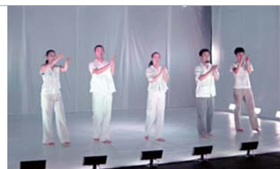
Contemporary dance show by “redined colors” group

In 2004 the Malaysian Ministry of Education committed itself to a policy of expanding Japanese-language education at the secondary level. In preparation for the debut of Japanese classes in regular schools, therefore, the Japan Foundation in Kuala Lumpur provided across-the-board support in compiling a new syllabus, producing language textbooks, and training instructors. In the field of