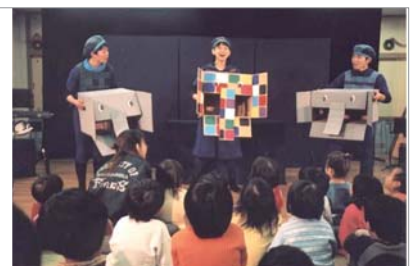
Kazenoko theatrical company on tour

In the aftermath of terrorist incidents, the Japan Foundation, Jakarta responded to concerns about large gatherings and regretfully canceled its high school Japanese speech contest. However, it successfully presented a concert by the Japanese a capella group INSPi; and it arranged a highly successful tour by the Kazenoko theatrical company,