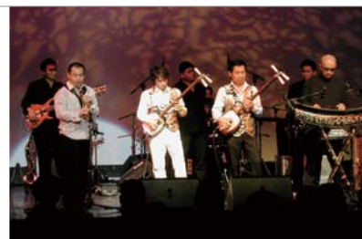
Tsugaru Shamisen vs. Boy Thai

In the field of Japanese-language education, the number of Thais studying Japanese reached 55,000 (which placed the country eighth in the world in a 2003 survey), and about 8,000 people took the 2004 Japanese-Language Proficiency Test (third in the world outside Japan). This dramatic increase in learners was in part due to the nine training courses for Japanese-language instructors provided over the