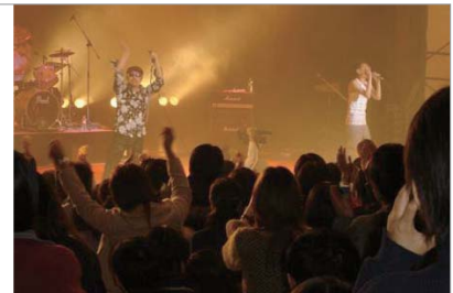
Japan Fans 2004

It was a year in which one could not help but be struck anew by the level of enthusiasm for things Japanese in China. An exhibition of Japanese artistic treasures at the National Museum of China in Beijing, for example, attracted over 34,000 visitors, and the number of people signing up for the Japanese-Language Proficiency Test reached some 100,000, the highest figure ever. The Japan Foundation, Beijing for