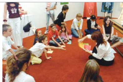
Children's origami workshop at the Notte Bianca

In 2004 the Japan Cultural Institute in Rome continued to operate its own library and offer Japanese-language courses. It organized exhibitions on subjects ranging from modern art to calligraphy, and arranged performances of traditional Japanese music, jazz, and contemporary music, among other genres. It also presented lectures on the history of Japanese-Italian relations and traditional and contemporary Japanese