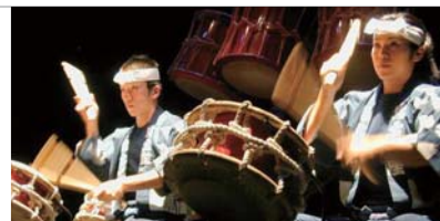
Ondekoza drummers in performance

The Japan Foundation, Budapest organized or supported several events in Hungarian cities other than Budapest, including a festival of contemporary Japanese films in Szeged and an exhibition of Japanese dolls in Keszthely. January 2005 marked the