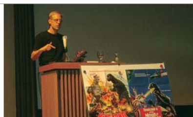
Honoring Godzilla's 50th birthday

The Japan Cultural Institute in Cologne focused on the needs of a new generation as it sought to foster positive views of Japan among young people. In the area of Japanese-language teaching, the Institute systematized its program administration. This reflects the passage of a year following the first offering of courses on a half-term basis. The Institute also co-sponsored more events with cultural organizations in Cologne and international exchange associations in