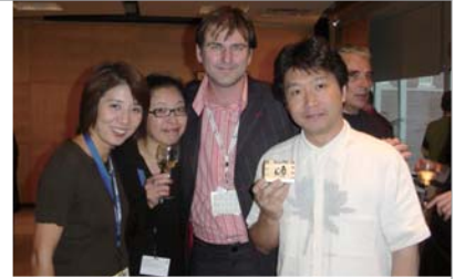
Film festival reception with director Hirokazu Koreeda

In honor of the 75th anniversary of diplomatic relations between Japan and Canada, the Japan Foundation, Toronto drew on programs to organize a series of events and programs relating to Japanese culture: the photo exhibition “Prince Takamado’s Visual Legacy,” lectures and movie screenings; financial support for conferences; and the distribution of small grants. Princess Takamado toured Canada in June 2004, and her visit left a lasting positive impact on the friendship between the two