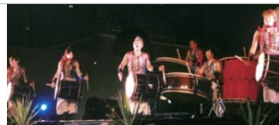
Performance of Japanese drumming by the Osaka Dadada-Dan Tenko

The Japan Foundation, Cairo offered a wide range of Japanese cultural events, including a performance of Japanese drumming, a week of Japanese movies, and a demonstration of Okinawan dancing. In addition, an eagerly anticipated Japan-Arab Policy Researchers'