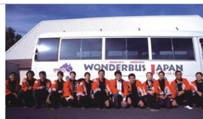
The “Wonderbus Japan” project

The Japan Foundation, Sydney moved to a more convenient location downtown, which move resulted in a considerable increase in library use, turnout at events, and number of memberships. Steps were taken, meanwhile, to bolster revenues by seeking the backing of firms in the private sector through the presentation of various events and the launch of a new newsletter. The number of companies and Japanese