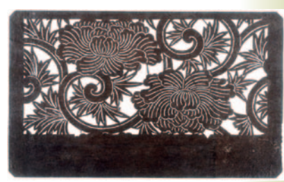
Exhibition KATAGAMI: Paper Stencils and Japonisme, Medium stencil showing peony scrollwork"© Takemoto Havuji

In film, more than 8,000 people gathered respectively to enjoy retrospectives on the works of Naruse Mikio and a collection of the entire 36 works of Ozu Yasujiro.