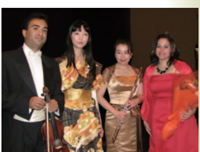
Japanese and Egyptian musicians of chamber

Moreover, as the Japan Foundation in Cairo serves as a regional base for cultural activities in the Middle East, it has implemented a Japanese film festival in Amman, Jordan's capital, with the assistance of the Japanese Embassy in Egypt.