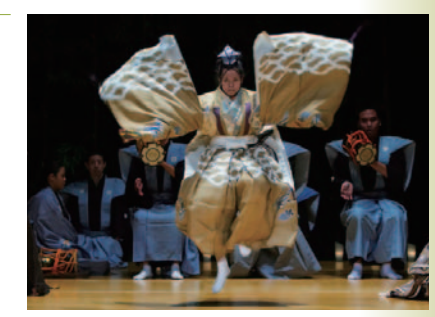
Commemorative performance of Noh theater (July 24)

A photographic exhibition "The World Heritage in Japan" was held in 16 venues around the country, attracting a total of 24,000 visitors.