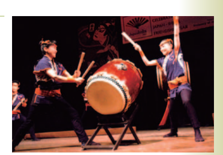
Performance by Oedo Sukeroku Daiko in New Delhi

Starting in FY2006, a Japanese-language course has been introduced into secondary schools, and the