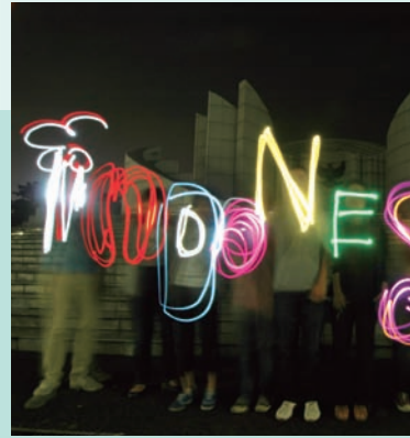
“PIKA PIKA GAMBAR HALILITAR 2008” by TOCHKA, in 2008