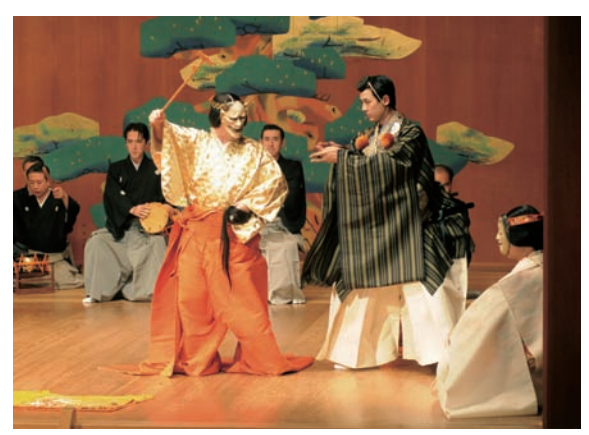
An Evening of Noh and Kyogen

The relocation of the office took place on February 23, 2009. At its new office located within the Kyoto International Community House building in Kyoto City's Sakyo-ku, the Kyoto Office has renewed its commitment to promoting international exchange activities through more active and stronger partnerships with local governments and a variety of cultural, arts and academic organizations.