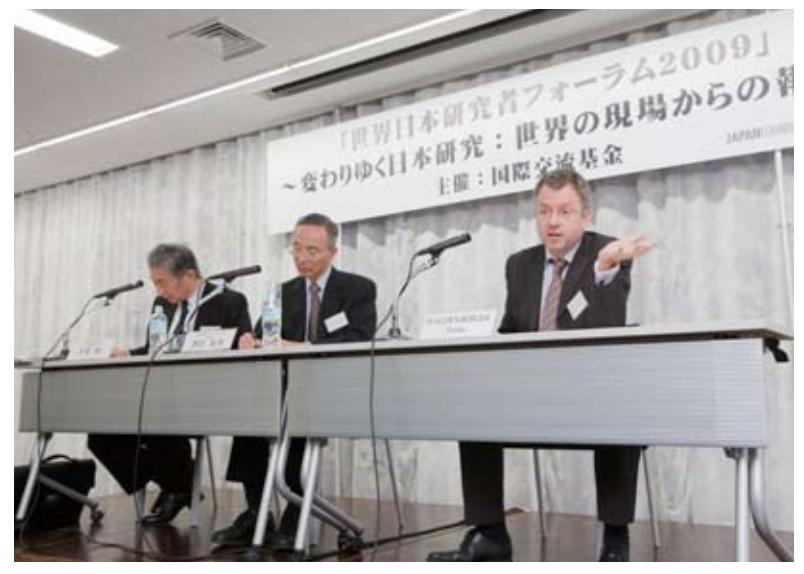
Public symposium at the Japan Foundation Headquarters

[Global Japanese Studies Scholars Forum 2009, Hakone-machi: Kanagawa Prefecture and Tokyo, October 13 to 15, 2009]