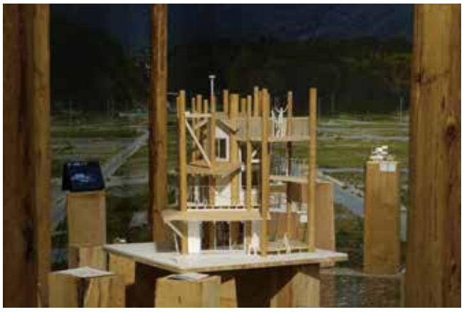
Japan Pavilion

The exhibit consisted of a panoramic photograph of Rikuzentakata covering the walls of the venue, logs of Japanese cedar damaged by the tsunami, images of the pre- and post-disaster landscape, more than a hundred models made throughout the design process by each of the architects, documentary videos, and materials. The project "Home-for-All" provided a place where people who had lost their homes and were forced to evacuate could gather and communicate; and through this project, the exhibit sought to explore the most primal themes of architecture—why and for whom a building is made. It touched the hearts and elicited the sympathy of people from around the world, drawing as many as 155,000 visitors in the three months starting in late August 2012. The Japan Pavilion won the Golden Lion for Best National Participation (photo on p. 9).