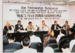
The Japan Foundation restarts as an independent administrative institution.