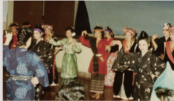
Okinawan dance in Southeast Asia in 1986.