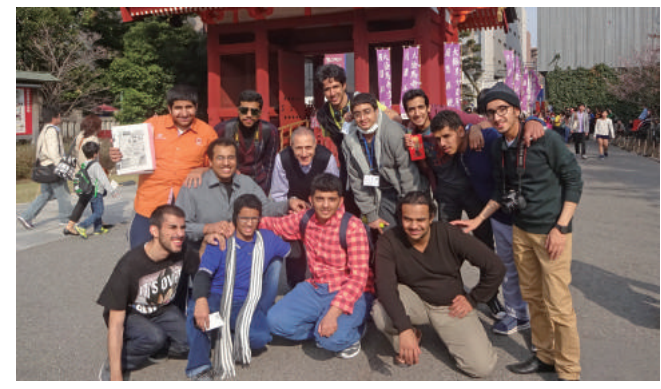
Japanese-language trainees from King Saud University visiting Asakusa