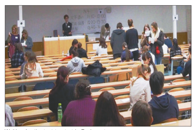
Waiting for the test to start in Budapest

In accordance with Japan's Economic Partnership Agreements (EPA), nurse and care-worker candidates from Indonesia and the Philippines are required to attain the N5 level. Those from Vietnam need the N3 level. N1 certification holders are awarded 15 points by the Immigration Bureau of Japan in accordance with the Points-based System for Highly Skilled Foreign Professionals . The N1 certification is also a prerequisite for taking the Ministry of Health, Labour and Welfare's National Medical Practitioners Qualifying Examination and practical nurse exam.