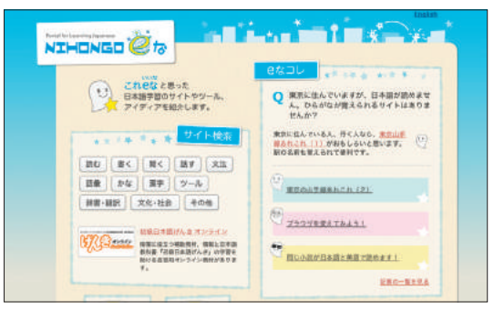
NIHONGO-e-NA home page

NIHONGO-e-NA is a useful portal for learning Japanese and deepening your understanding of Japanese culture. In fiscal 2014, we continued to provide information through the PC website and iOS and Android apps. As a result, the number of users have been increasing. The PC site has 253 articles, while the apps have 44. Japanese-language learners around the world are using NIHONGO-e-NA.