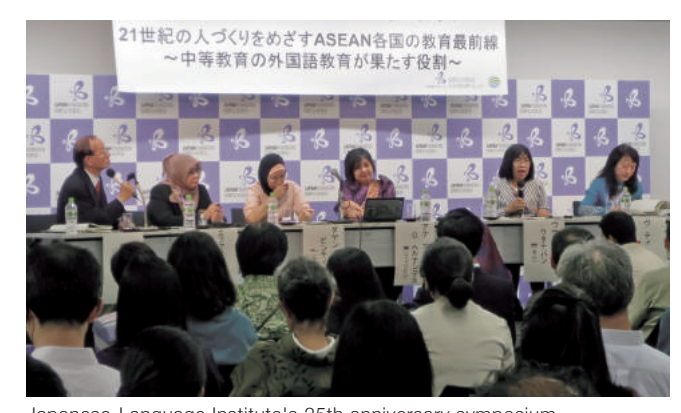
Japanese-Language Institute's 25th anniversary symposium Preparing Students for the 21st Century: The Front Line of Education in ASEAN Member States

The Japan Foundation Japanese-Language Institute, Kansai is also expanding training programs conducted on consignment. One example was the training session in fiscal 2014 for students from King Saud University in Saudi Arabia. A Japanese-language training session for King Saud University students visiting Japan was held for the first time. This training session was sponsored by Mitsubishi Corporation's donation to the university.