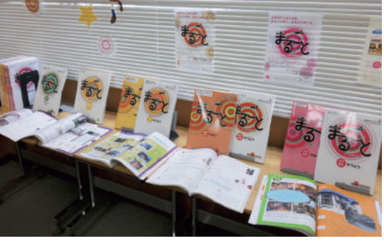
Marugoto: Japanese-language and Culture books (International Fair 2014 in Kita-Urawa.)