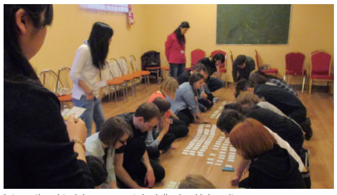
International training camp at Jagiellonian University