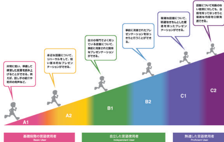
Japanese-language proficiency levels according to the JF Standard