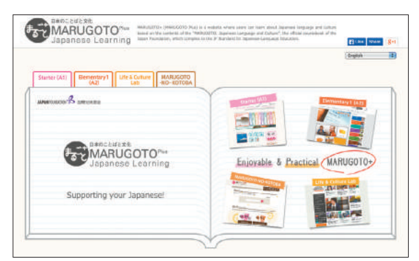
Marugoto + (Marugoto Plus) website home page

To make it easier for people around the world to access the Marugoto+ ( Marugoto Plus ) website, a content delivery network (CDN) server has been employed.