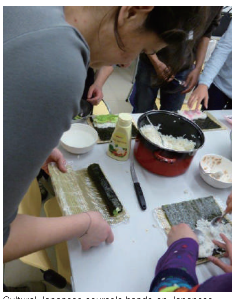
Cultural Japanese course's hands-on Japanese cooking event in Budapest

For example in Paris, the Japanese Culture Atelier covered kanji characters, Noh plays, movies, and other specific themes. Also, "NIHONGO Shaberon" was a Japanese conversation event with native Japanese living in Paris. In Madrid, a new Japanese conversation club called "¡Vamos a nihonguear!" was formed to hold games and cultural activities.