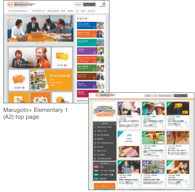
Marugoto + Elementary 1 (A2) Life & Culture