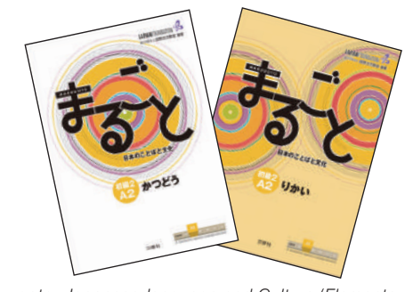
Marugoto: Japanese-language and Culture (Elementary 2 (A2) - coursebook for communicative language activities: Katsudo / coursebook for communicative language competences: Rikai)