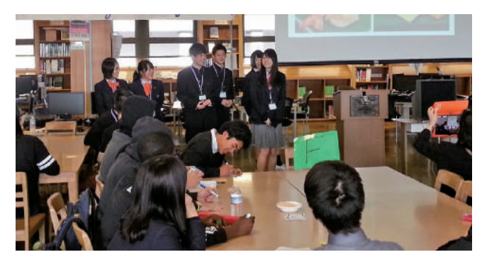
A high school group giving a presentation in the U.S.

For thematic invitation programs, 153 young researchers from 16 think tanks based in Washington, D.C. were invited to Japan. Their main objectives were to increase their understanding of Japan's current policies and to establish a network with the intellectual community. Also, 19 young American creators