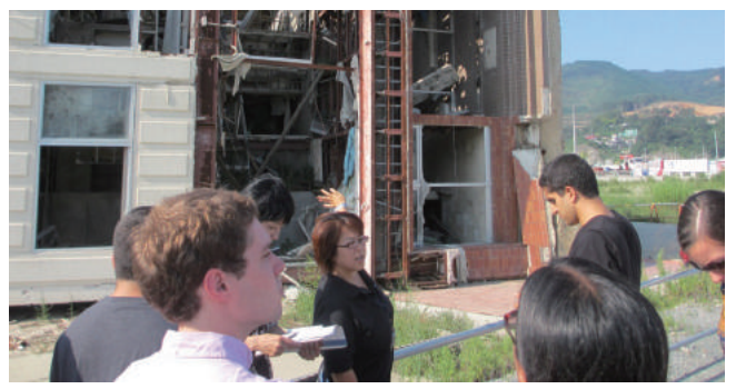
Visiting Onagawa that was heavily damaged by the 2011 Great East Japan Earthquake and tsunami