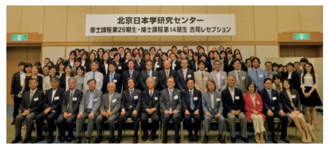
Reception for master's degree and Ph.D candidates from the Beijing Center for Japanese Studies

The Peking University Research Center for Contemporary Japan is jointly operated by Peking University and the Japan Foundation. It aims to produce Chinese specialists having a good knowledge of modern Japan and specialized knowledge. In fiscal 2014, lectures of Japanese studies were given to 20 Peking University doctoral candidates in the social sciences. Eleven scholars from Japan were sent to the center to lecture for a short term. In June, 20 students from the center were invited to a 15-day study program in Japan.