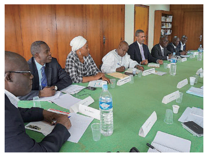
Japanese studies seminar in West Africa

With Japanese studies taking root in African countries, the theme of Emergence attracted the most interest in the seminar along with how it related to Japan's modernization. A network of major universities pursuing Japanese studies was established in French-speaking West African countries.