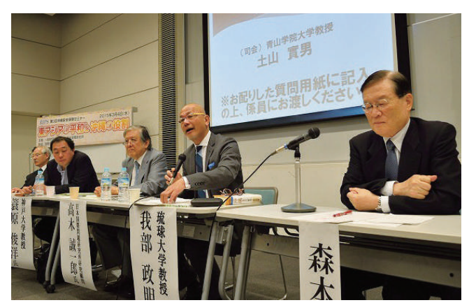
RIPS (Okinawa Seminar)