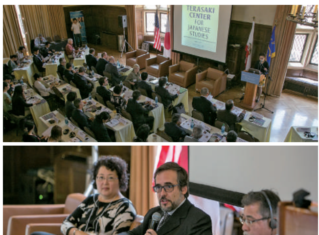
Public symposium at UCLA