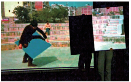
Left: Video combined with a dance performance

We shall continue providing opportunities for joint exhibitions by Japanese and Indian artists expressing new viewpoints and values inspired by what they experienced and encountered in each other's country.