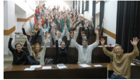
Below: Lecture at Moscow State University of Printing Arts