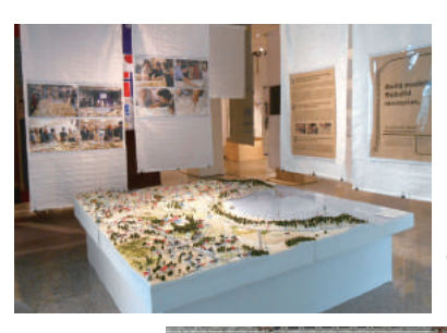
Left: Earth Manual Project exhibition

Japan, the Philippines, and the rest of Asia are actively sharing their experiences and lessons of disaster preparedness.