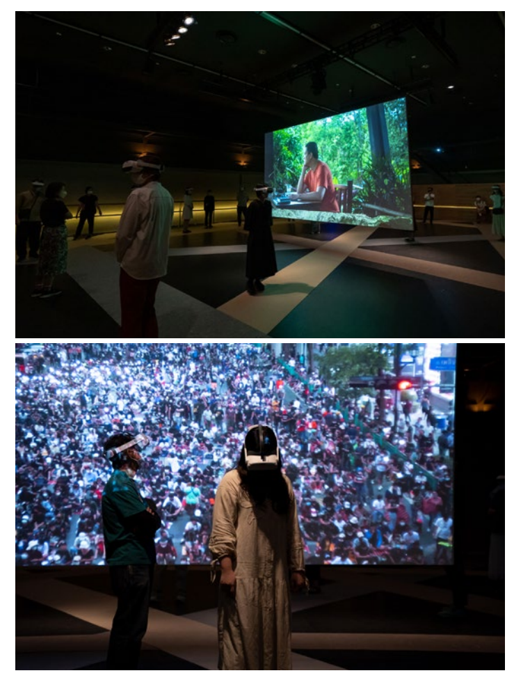
Figure 2 (Top) / Figure 3 (Bottom): A Conversation with the Sun (VR) (Aichi Triennale 2022, performance photo)

While looking at the central frame, six or seven frames appear floating in the distance. They show footage of people sleeping indoors or outdoors and trees swaying in the wind. The floating frames disappear, and then the floor transforms into reddish-brown ground, and stones of various sizes slowly fall from the sky. As piano music composed by Sakamoto mixes with ambient jungle sounds, the surrounding scenery switches to a cave. Emotional music briefly brings back vaguely familiar memories and images. Then, a clay statue suddenly appears in a corner of the cave. As the Sun moves closer to the statue's head, the statue's eyes melt. The entire space slowly rotates counterclockwise, and the ceiling of the cave starts to open up. The footage ends with the Sun floating up toward the ceiling and dividing into countless balls of light.