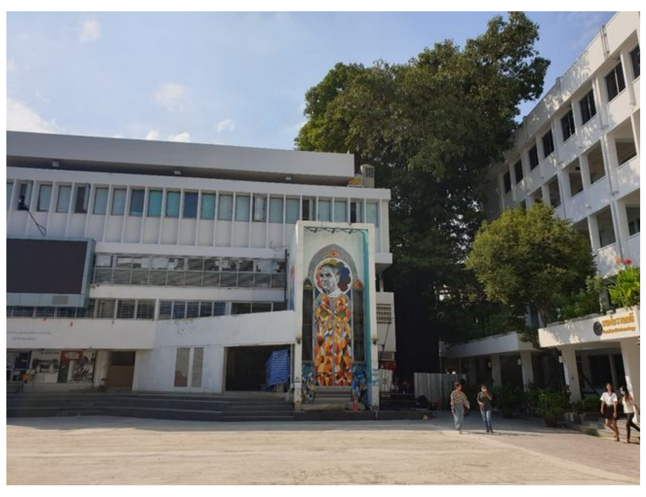
A view of Silpakorn University, 2020