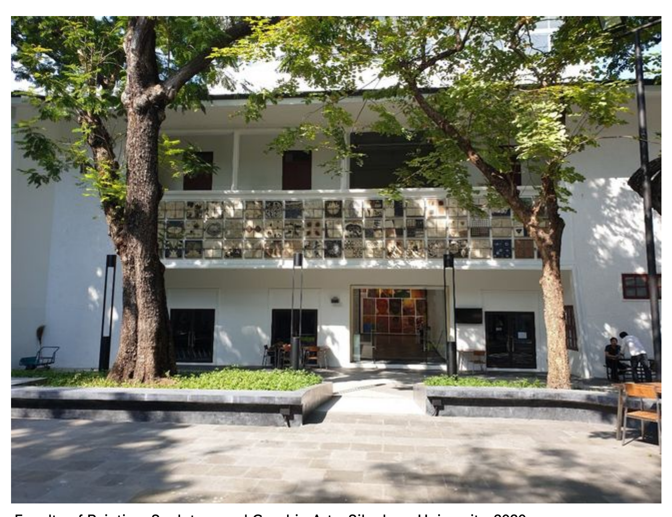
Faculty of Painting, Sculpture and Graphic Arts, Silpakorn University, 2020