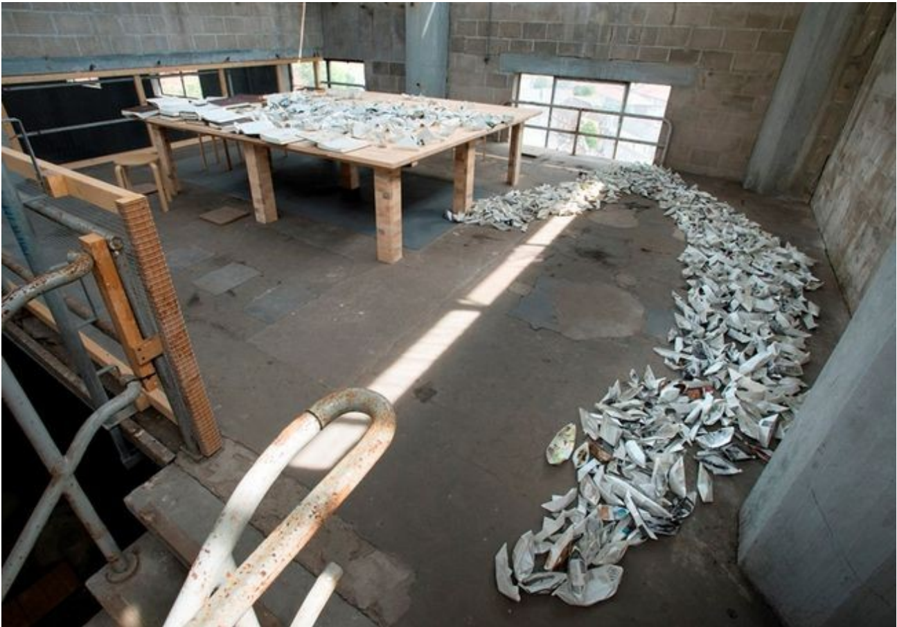
Simryn Gill, Paper Boats (2008) installation, made from Encyclopedia Britannica, 1968 edition.