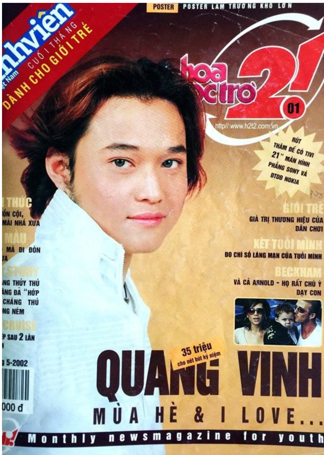
Hoa học trò 2!

First published in May 2002, 2! is a magazine dedicated for late teens and young adults. In this first issue, English text appears on the front cover, demonstrating changing attitude towards in mass media consumption.