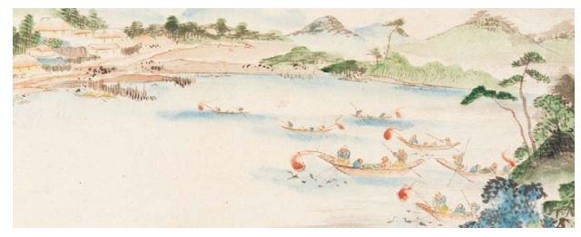
1. Fishing with cormorants to catch the ayu (sweetfish)