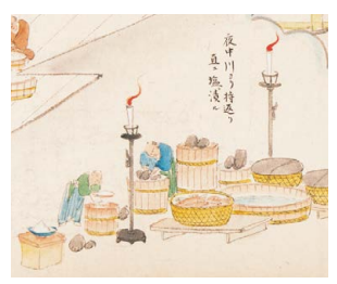
2. Salting the fish