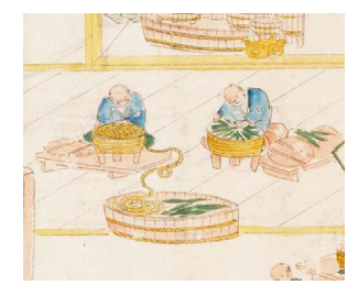
5. Arranging the sushi in wooden tubs and covering with bamboo grass