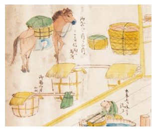
7. Loading onto a horse ready to go to Edo