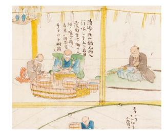
Stuffing the fish with the rice. Workers wear masks.

Once the system for tributes had been established, it became difficult to make changes. With ayu-zushi, the specific date by which the tribute had to be presented was fixed. That date had to be adhered to, and issues such as being unable to catch the fish were not allowed to disrupt the schedule. The shogun had to have ayu-zushi on his table on a particular day, so the officials charged with managing the items for the menu made their preparations months in advance. Excuses were out of the question. Official records of exactly what the shogun had for his lunch on which day of which year still exist today.