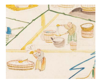
Cooling the steamed rice with a fan, then watering it