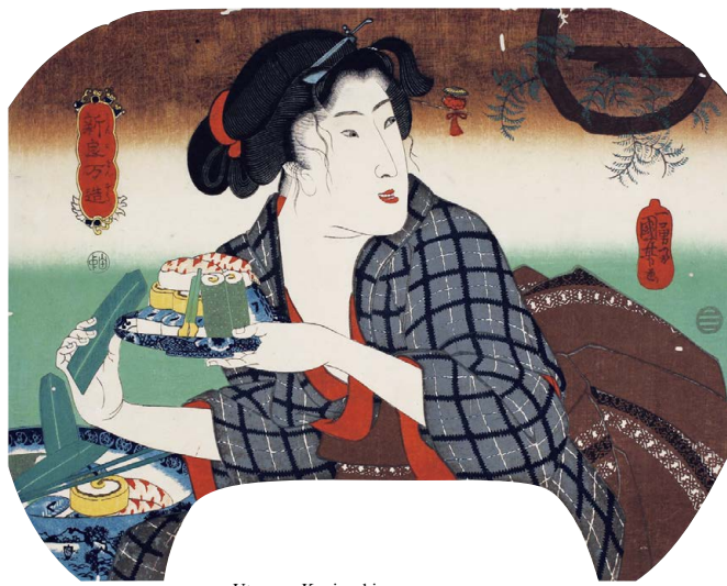
Utagawa Kuniyoshi Sushi, from The Universe of Women c. 1843

Depictions of sushi and sushi stalls in ukiyo-e works like these are surprisingly rare compared to the huge number of ukiyo-e prints that were produced overall. Furthermore, there are almost no ukiyo-e prints that focus on the sushi itself. Sushi and New Year's Sake (No. 22) is an exception. This is also the case for other popular foods besides sushi, such as soba noodles, tempura , or eel ( unagi ). Ukiyo-e art depicted things that were the object of the general populace's yearning and fascination, so common, everyday things like food did not attract as much attention. Nevertheless, ukiyo-e prints are a valuable resource for learning about sushi at a time before the invention of