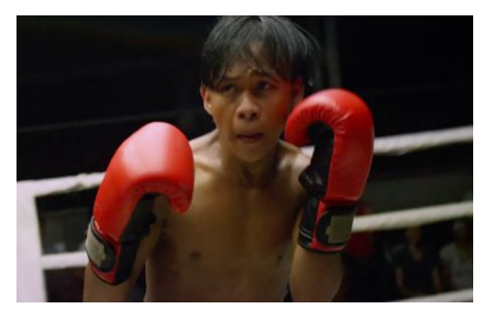
Kid Kulafu