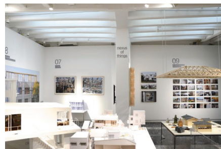
Installation view in the Japan Pavilion