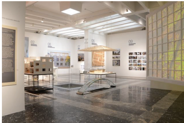
Installation view in the Japan Pavilion