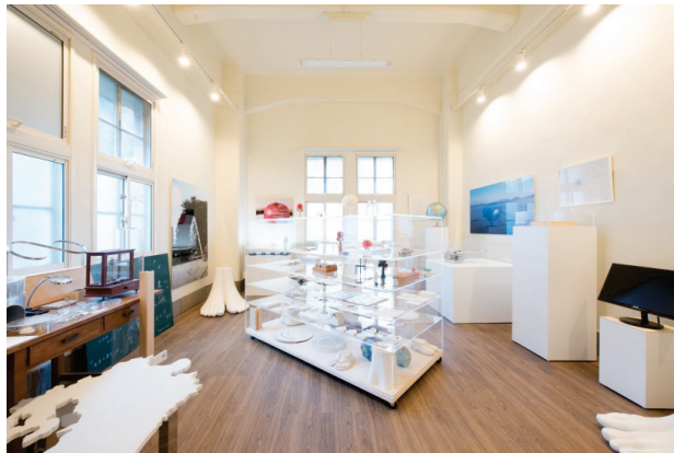
Research Center for Advanced Science and Technology, The University of Tokyo, Building I Gallery