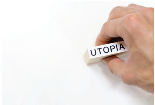
Untitled