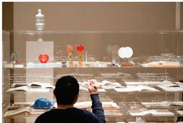
Tokyo Midtown Design Hub 49 th Exhibition IROHA Exhibition, 2014