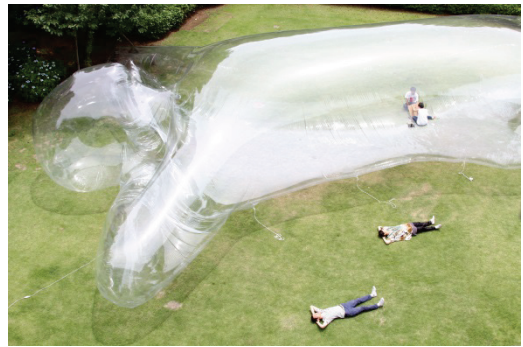
Large-sized Aerial Being