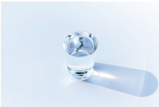
Compass of Japanese Islands ©Yasuhiro Suzuki