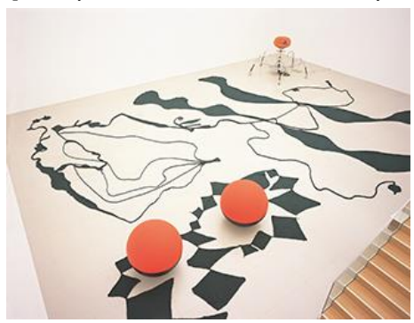
Kodai NAKAHARA Viridian Adaptor + Kodai's Morpho II 1989 Collection of Toyota Municipal Museum of Art

[Examples from the art exhibition, Japanorama ]