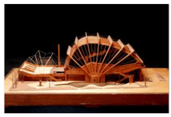
KIKUTAKE Kiyonori Miyakonojo Civic Center/Model 1966 Collection of Kikutake Architects