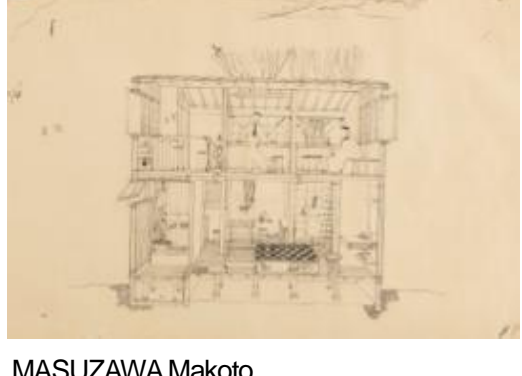
MASUZAWA Makoto Minimal House/Sectional sketch 1952 Collection of Masuzawa Architects & Associates