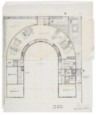
ITO Toyo U-Shaped House/Study in the early phase n.d. Collection of Toyo Ito & Associates, Architects