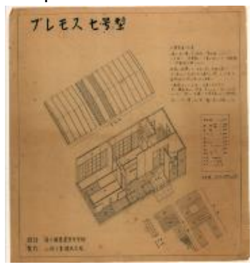
MAYEKAWA Kunio PREMOS Model No.7 House/Description of building 1946 Collection of Mayekawa Associates, Architects & Engineers