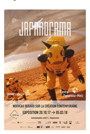
(left) Centre Pompidou-Metz