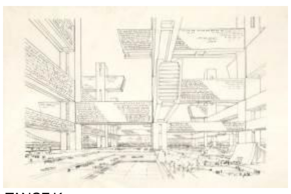
TANGE Kenzo A Plan for Tokyo, 1960-Toward a Structural Organization/Perspective of Office Tower 1960 Collection of Urban Design Laboratory, Department of Urban Engineering, the University of Tokyo