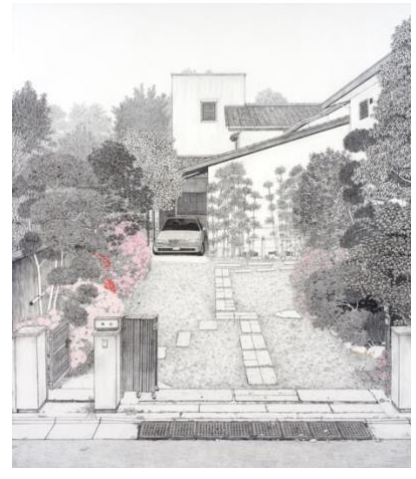
Yukiko Suto, W House – Entrance Side, 2010