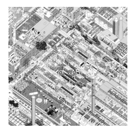
Drawing Architecture Studio, a drawing from: A Little Bit of Beijing: 798, 2013 (© Drawing Architecture Studio)