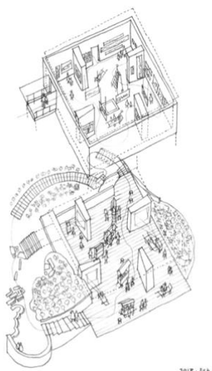
Momoyo Kaijima, Exhibition Design Drawing, 2018 (© Momoyo Kaijima)