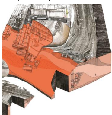
Éva Le Roi, a drawing from: Coupe!, 2008 (© Éva Le Roi)