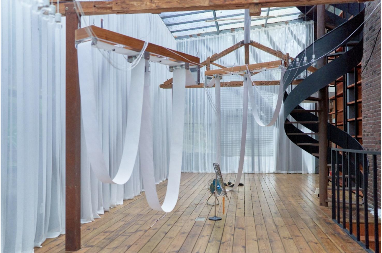
Yuko Mohri I/O 2011–2023 The 14th Gwangju Biennale installation view

Her works are in the collections of Ashmolean Museum (Oxford), Centre Pompidou (Paris), M+ (Hong Kong), Musée d’art contemporain de Lyon (Lyon), The National Museum of Modern Art Kyoto (Kyoto), Taoyuan Museum of Fine Arts (Taoyuan), Queensland Art Gallery (Brisbane) etc.