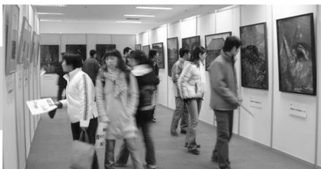
Touring exhibition “Capturing the beauty of Japan”

The Japanese-Language advisors dispatched by the Foundation and the Course Teaching Material Institute of China co-hosted a seminar for Japanese-Language teachers in junior and senior high schools. The seminar was held for the first time in the southern district of China, thanks to the cooperation of the Wuhan Foreign Language Institute. At Wuhan, 25 secondary-school Japanese-Language teachers attended from two directly governed cities and eight provinces in the Hua Dong, Hua Zhong and Hua Nan regions, and they all displayed a great deal of enthusiasm. At the seminar in Beijing, 41 Japanese-Language teachers from Hua Dong region attended. Both seminars indicated the Center’s support programs for Japanese-Language in the secondary school level have taken root in the course of five years since the dispatch of the first Japanese-Language advisor.