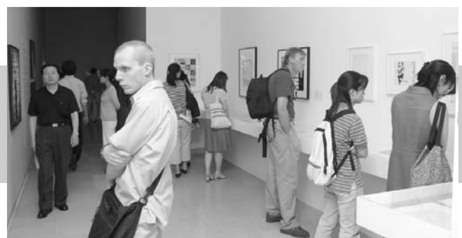
“Yes Yoko Ono” Exhibition