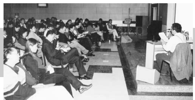
Lecture on Japanese movies

The Foundation supports intellectual exchange between Japan and China and among Asian nations. In addition to researchers of