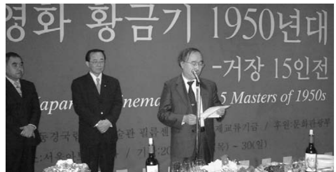
"Retrospective of Japanese Films" Exhibition

This event was co-organized by the Japan Foundation, the National Museum of Modern Art, Tokyo and the Korean Film Material Institute, as an exchange project with the "Korean Films: The Glorious 1960s" retrospective (held from November to December 2002 in Tokyo). The retrospective presented fifteen works by fifteen Japanese filmmakers who were active in the 1950s, the so-called golden age of Japanese films. Jointly held was a forum inviting specialists on Japanese film. The number of visitors reached 4,631, exceeding the average attendance of Japanese