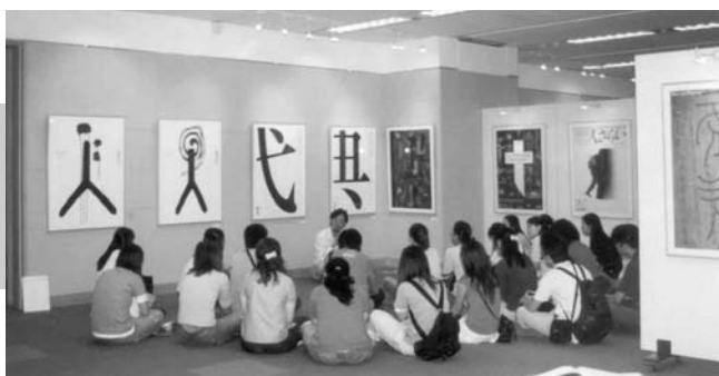
"Ikko Tanaka's Posters" Exhibition

When President Roh Moo-hyun visited Japan in June 2003, he stated in a Korea-Japan joint communiqué that "Korea shall expand the admission of Japanese popular culture in order to activate cultural exchange." The 4 th movement to lift the ban was announced in September and December, to be executed in January 2004. In the same communiqué, it was also announced that the year 2005, marking the 40 th anniversary of the normalization of Japan-Korea diplomatic relations, should be designated as the "Japan-Korea Friendship Year 2005." Exchanges between the two countries will be promoted at all levels throughout this year.