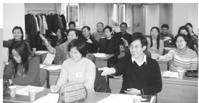
Seminar for Japanese-Language teachers in secondary schools